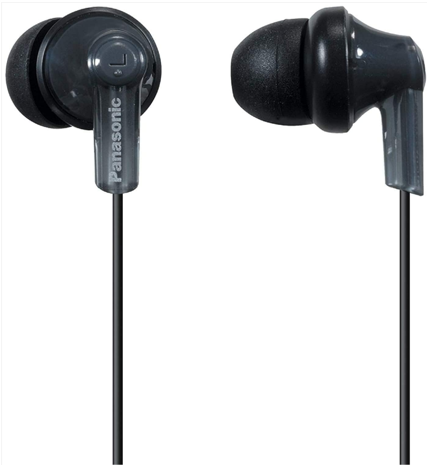
Image: Panasonic ErgoFit Wired Earbuds in black, showcasing their sleek design.