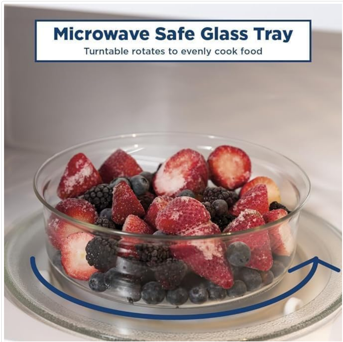
Image: Close-up of the microwave's glass turntable with frozen berries and blueberries on it, showing the rotation mechanism. The turntable rotates to evenly cook food.

Place the turntable support ring in the center of the microwave cavity. Position the glass turntable securely on top of the support ring, ensuring it sits properly on the drive hub.