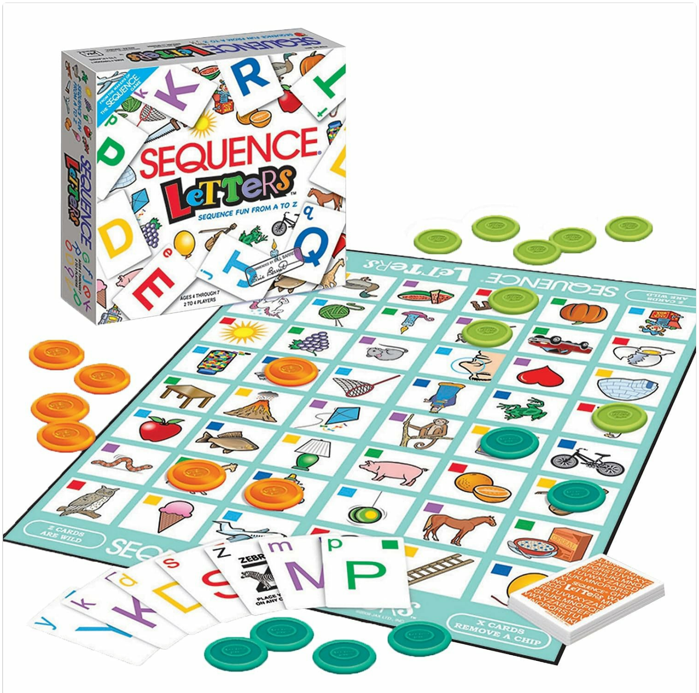
Image: All components of the SEQUENCE Letters game, including the board, cards, and chips, ready for play.