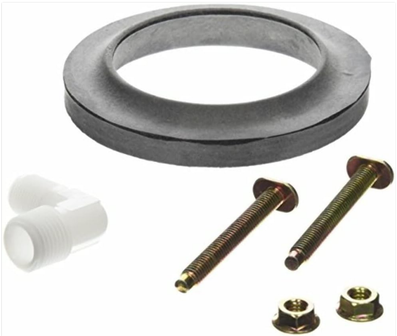
Figure 2: Close-up view of the wax ring and mounting bolts included in the package.