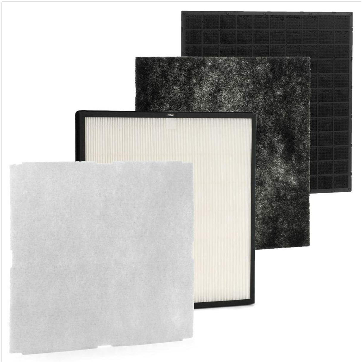
Image: Components of the Rabbit Air MinusA2 Odor Remover Filter Kit.