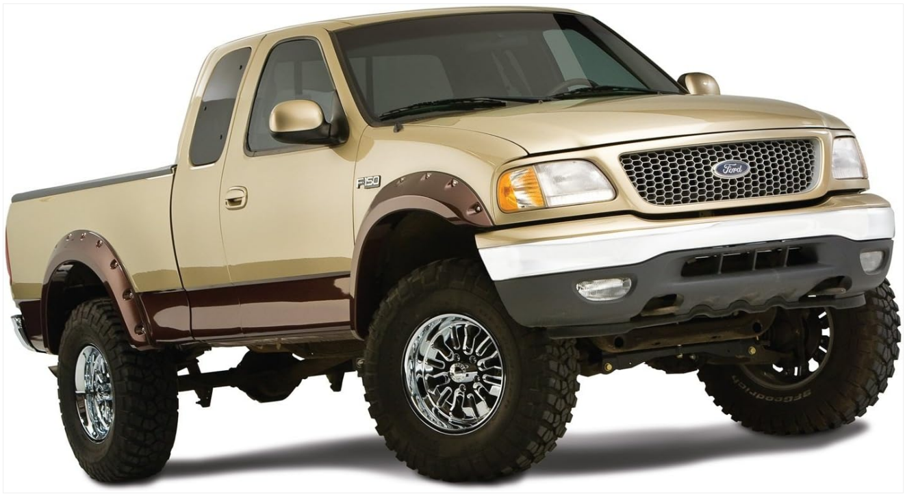
Image 2.1: Ford F-150 with Bushwacker Cutout Fender Flares installed.