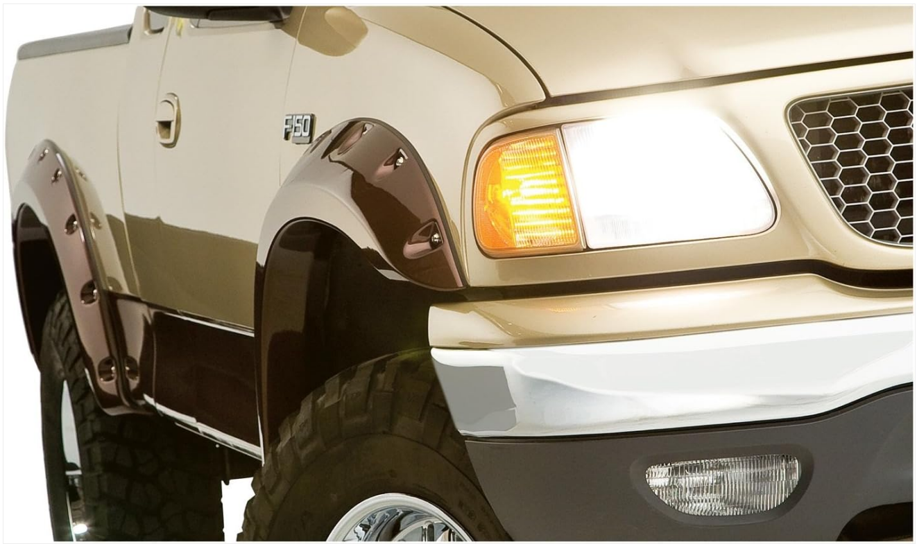
Image 6.2: Detailed view of an installed front fender flare (for reference, this product is rear flares only).

For visual guidance, please refer to the official Bushwacker website or contact customer support for any available installation videos.