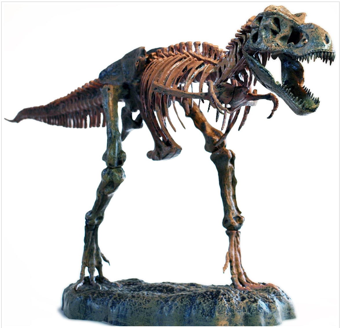
Image: Close-up view of the assembled T-Rex skeleton model, showing the detailed bone structure and articulation.