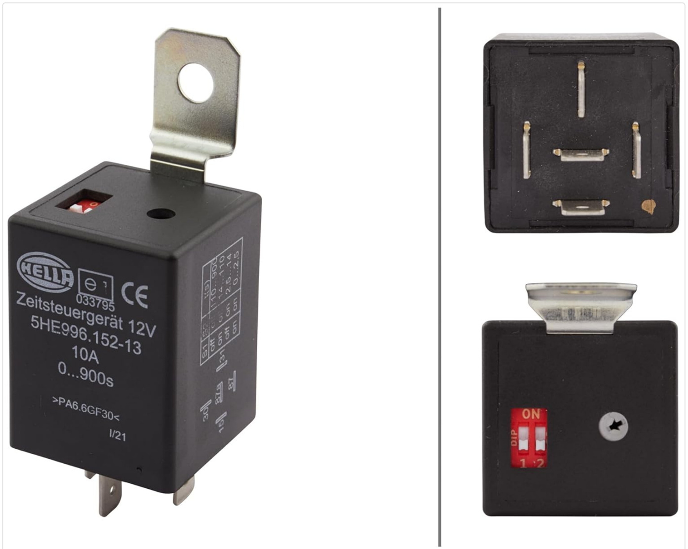
Image 4: Side view of the HELLA 996152131 relay showing the red dip switches labeled 1 and 2, and the rotary adjustment dial with an arrow for setting the delay time.

The relay allows for a delay period from 0 seconds up to 15 minutes (900 seconds). The dip switches provide a coarse adjustment range, while the rotary dial offers fine-tuning within that range.