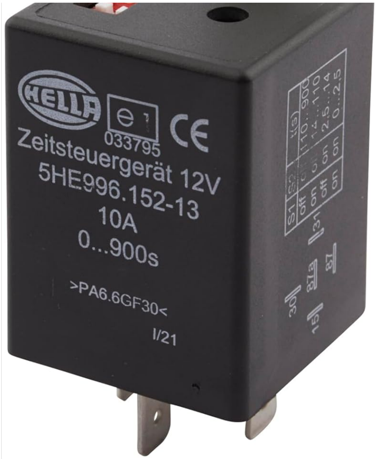
Image 1: HELLA 996152131 12V Delay-On-Release Time Delay Relay. This image shows the main view of the black rectangular relay with a metal mounting tab and visible pin numbers on the side.