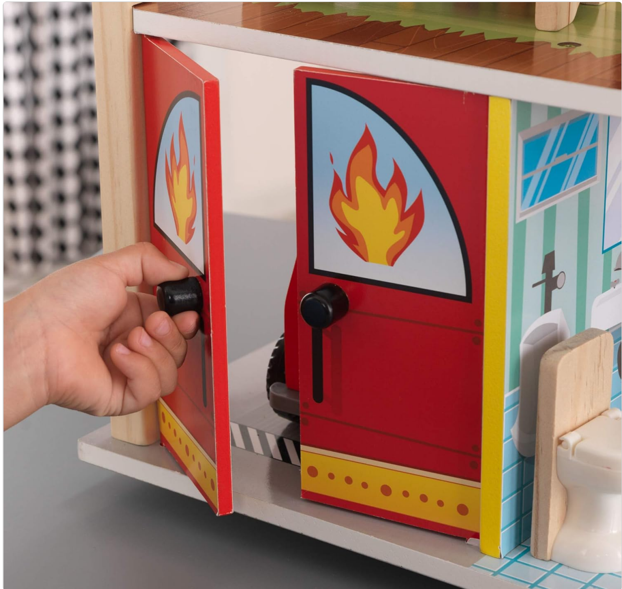
Image: A close-up of a child's hand operating the functional red garage doors of the fire station, which open and close to allow vehicles access.