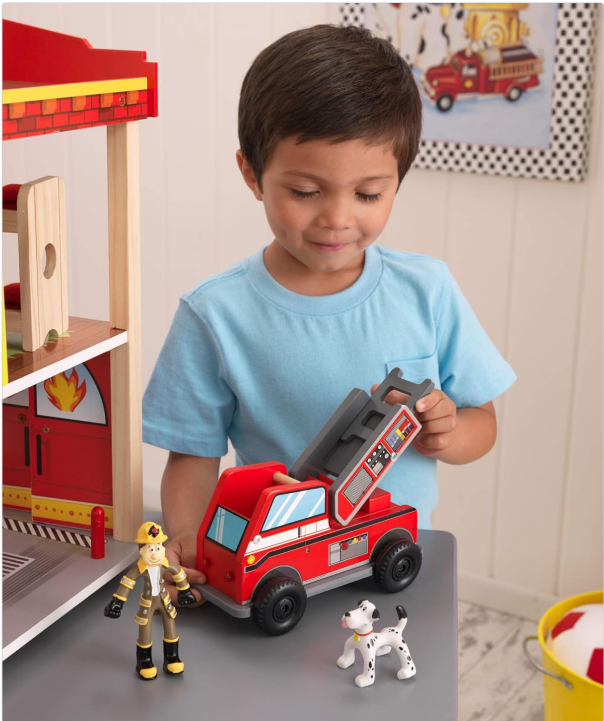
Image: A child is shown playing with the red fire truck accessory, demonstrating its extendable ladder feature, ready for rescue scenarios.