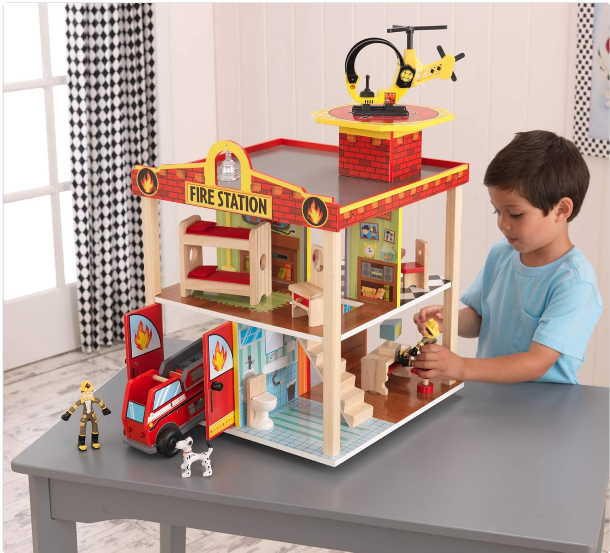
Image: A young child engages with the KidKraft Wooden Fire Station Set, moving a firefighter figure near the fire truck. The playset features multiple levels, a helipad, and detailed interior designs.