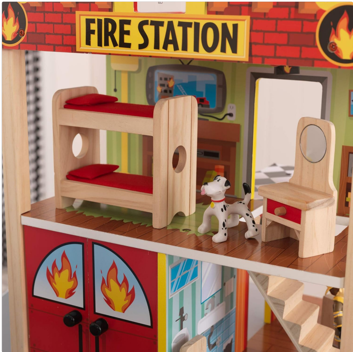
Image: A detailed look inside the fire station, highlighting the bunk beds, a Dalmatian dog figure, and a small dressing table, all part of the playset's accessories.