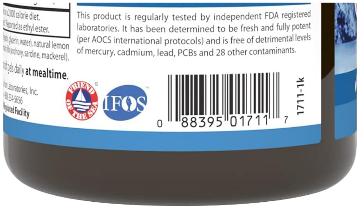
Image: Back label of the product bottle, detailing the professional strength, lemon-flavored fish oil concentrate, sustainable sourcing, and purity guarantees. It highlights "Gluten-free" and "No Artificial Preservatives".