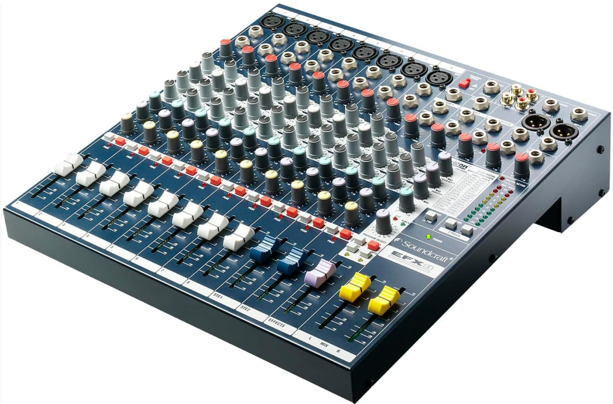
Figure 2: Side view illustrating potential rack mounting points.