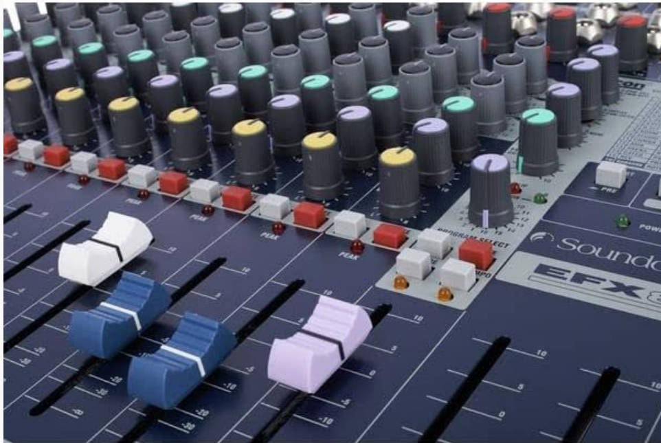
Figure 4: Close-up of individual channel controls.