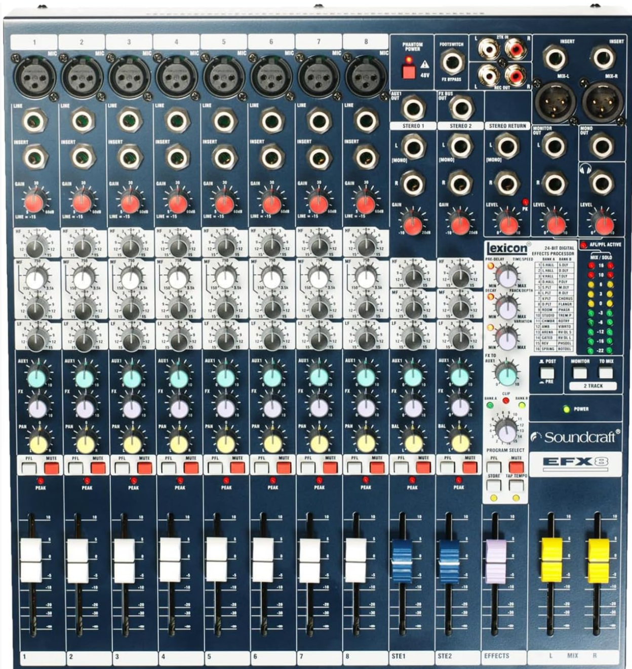
Figure 3: Front view detailing the various input and output connections.