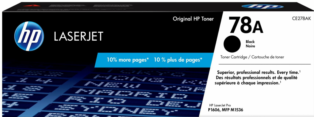
Image: HP 78A Black Toner Cartridge retail packaging.