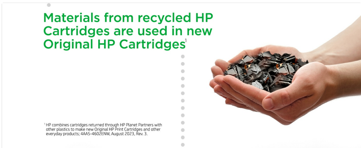
Image: Hands holding small pieces of recycled plastic, illustrating HP's commitment to using recycled materials in new cartridges.