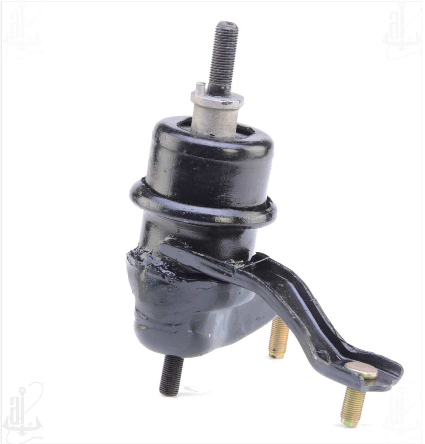
Figure 7.1: Angled view of the transmission mount, highlighting its structural integrity.