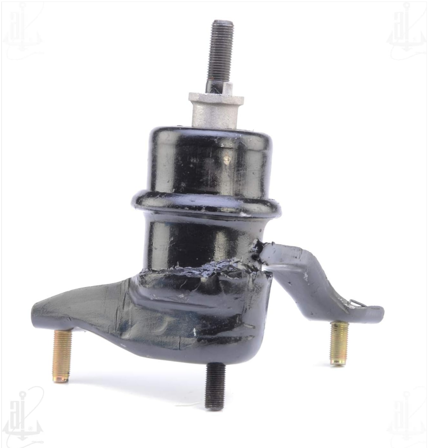
Figure 4.2: Alternative side view, showing the mounting bracket design.