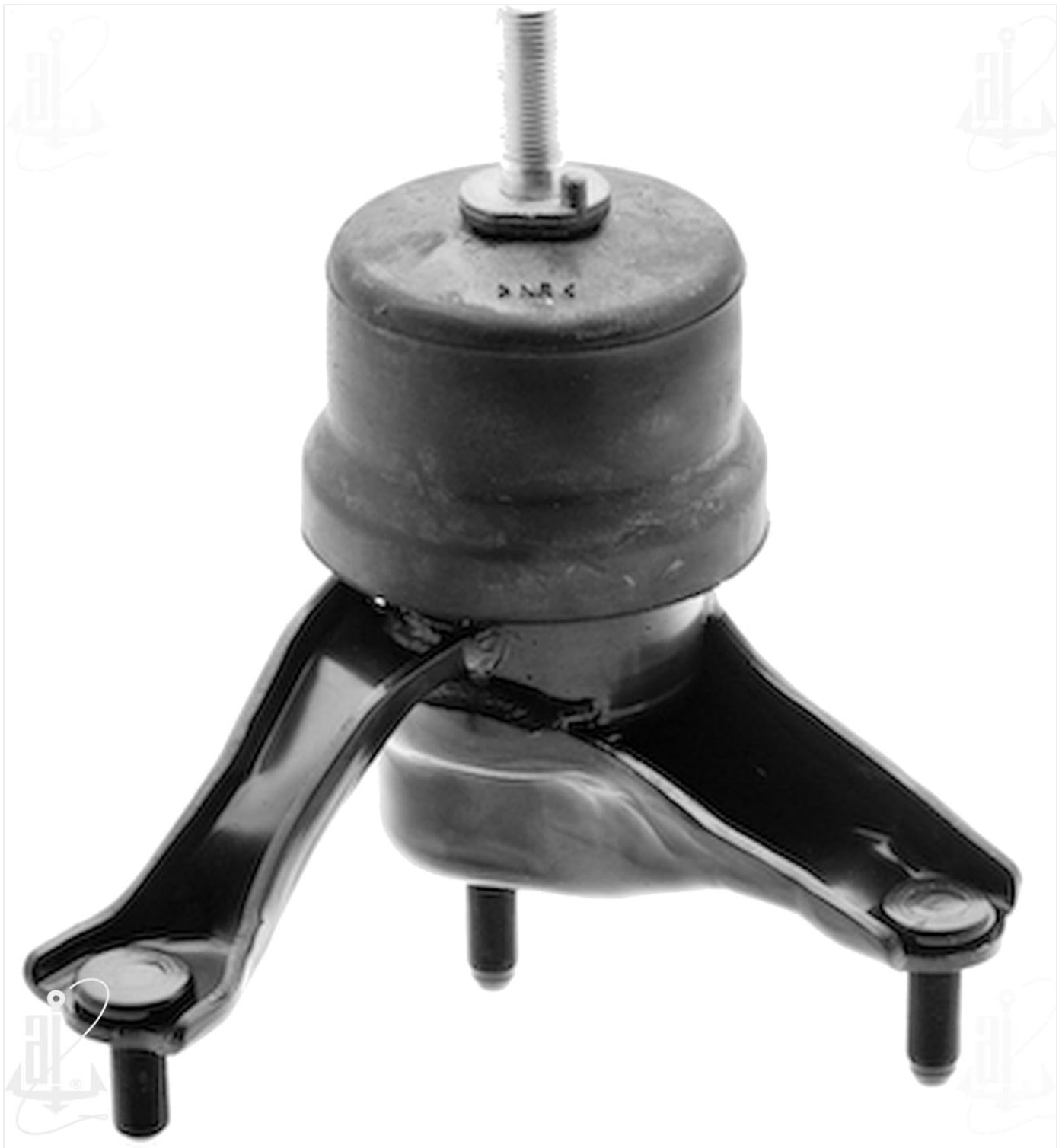
Figure 2.1: Front view of the AUTO XTRA 9236 Transmission Mount, showing its robust construction and mounting points.