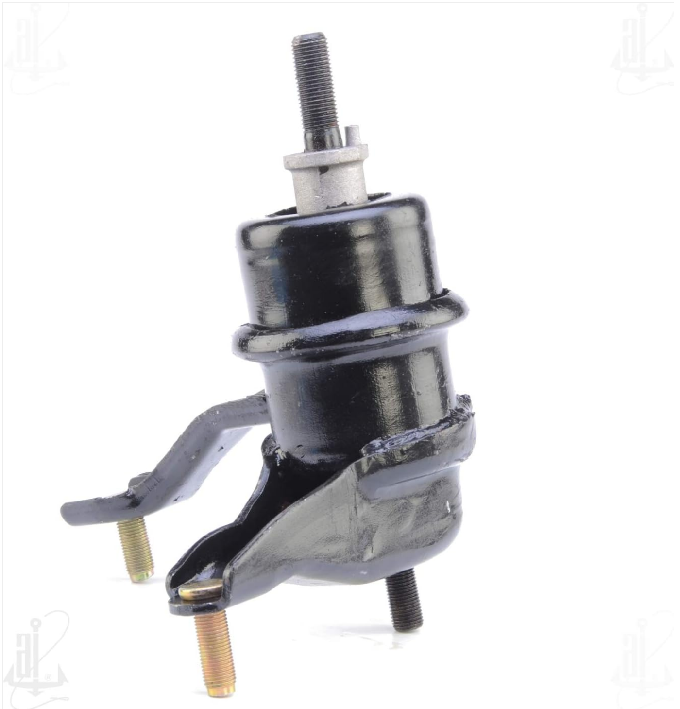
Figure 4.1: Side view of the transmission mount, illustrating its profile and bolt locations.