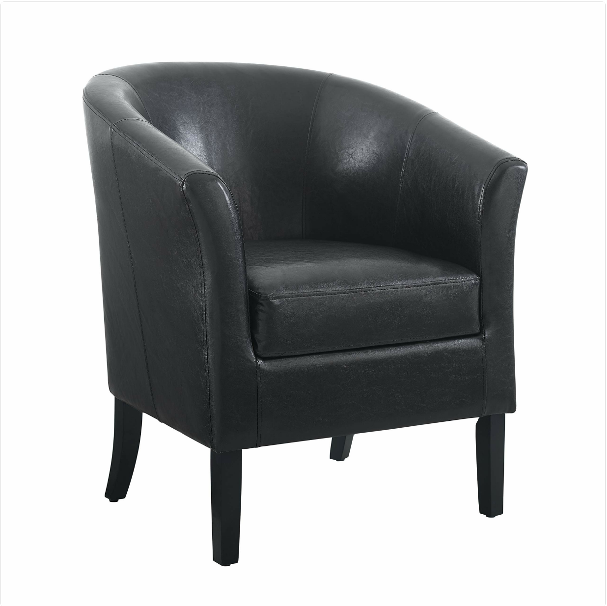
Image: The Linon Simon Club Chair, showcasing its overall design and black faux leather upholstery.