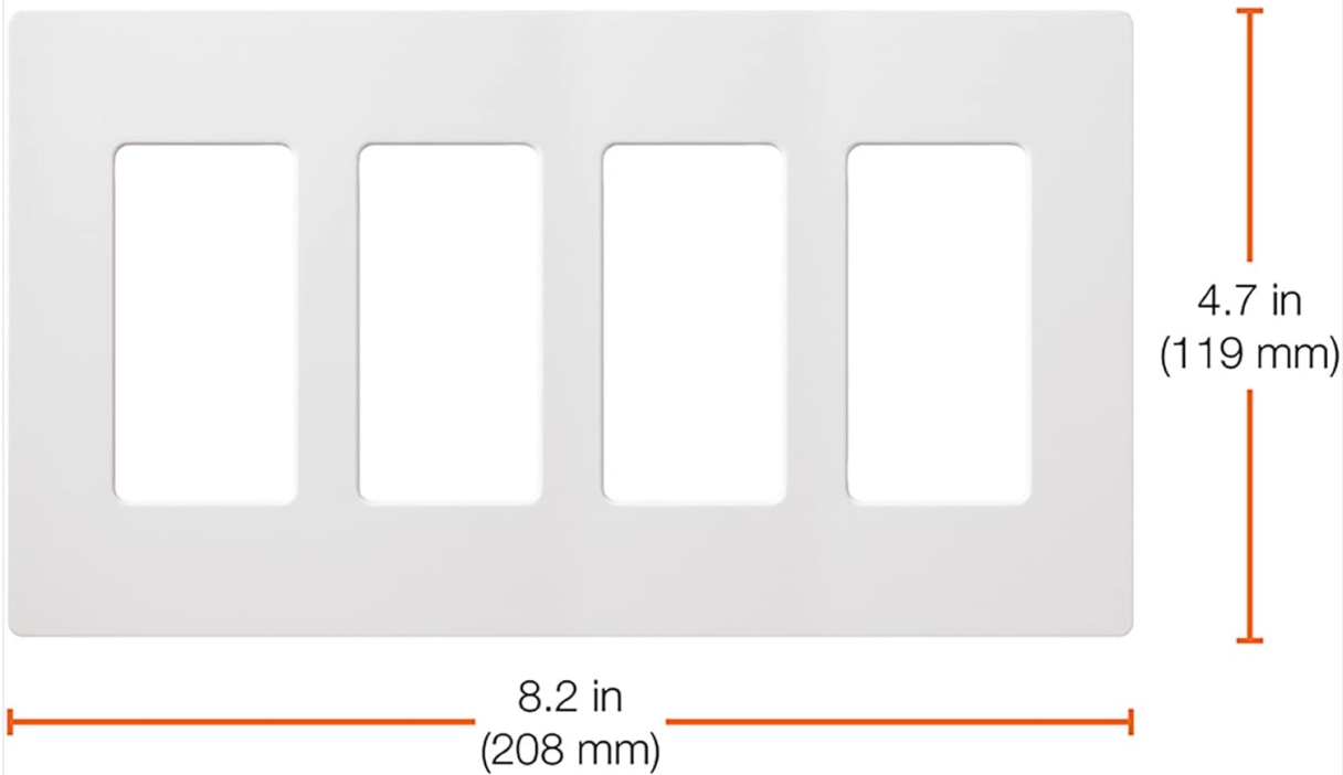
Image: Diagram showing the approximate dimensions of the Lutron Claro 4-Gang wall plate: 8.2 inches (208 mm) long and 4.7 inches (119 mm) high.