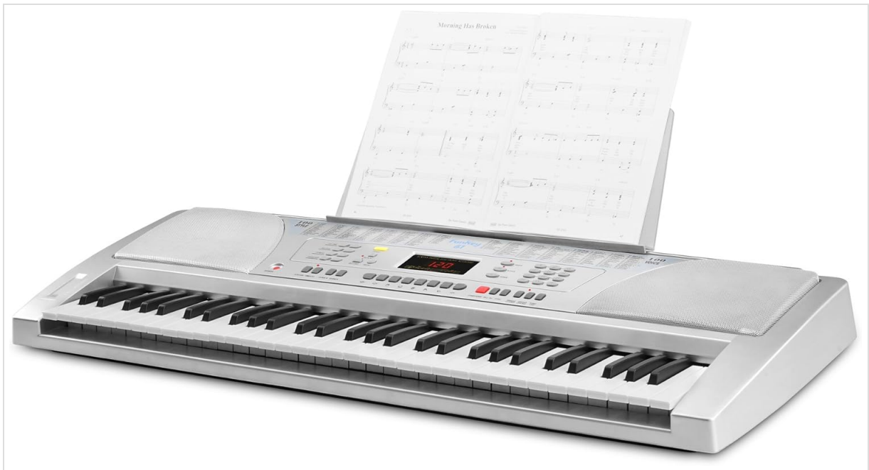
Image: The Funkey 61 SL Keyboard with the music stand attached, holding sheet music.