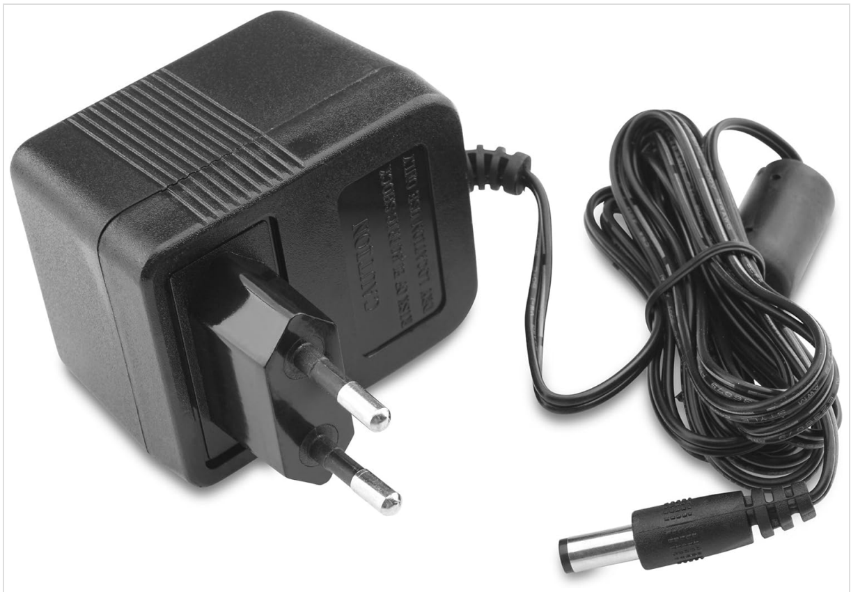
Image: The included power adapter for the Funkey 61 SL Electronic Keyboard.