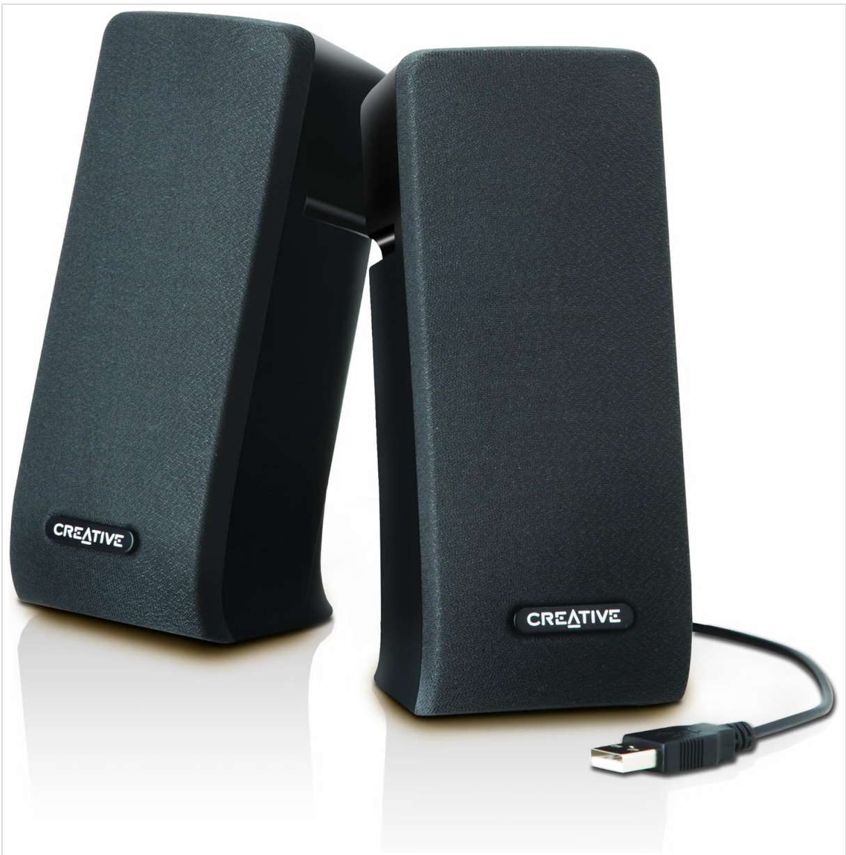
Image: The Creative A40 2.0 Desktop Speaker System, showing both speakers and the integrated USB power cable.