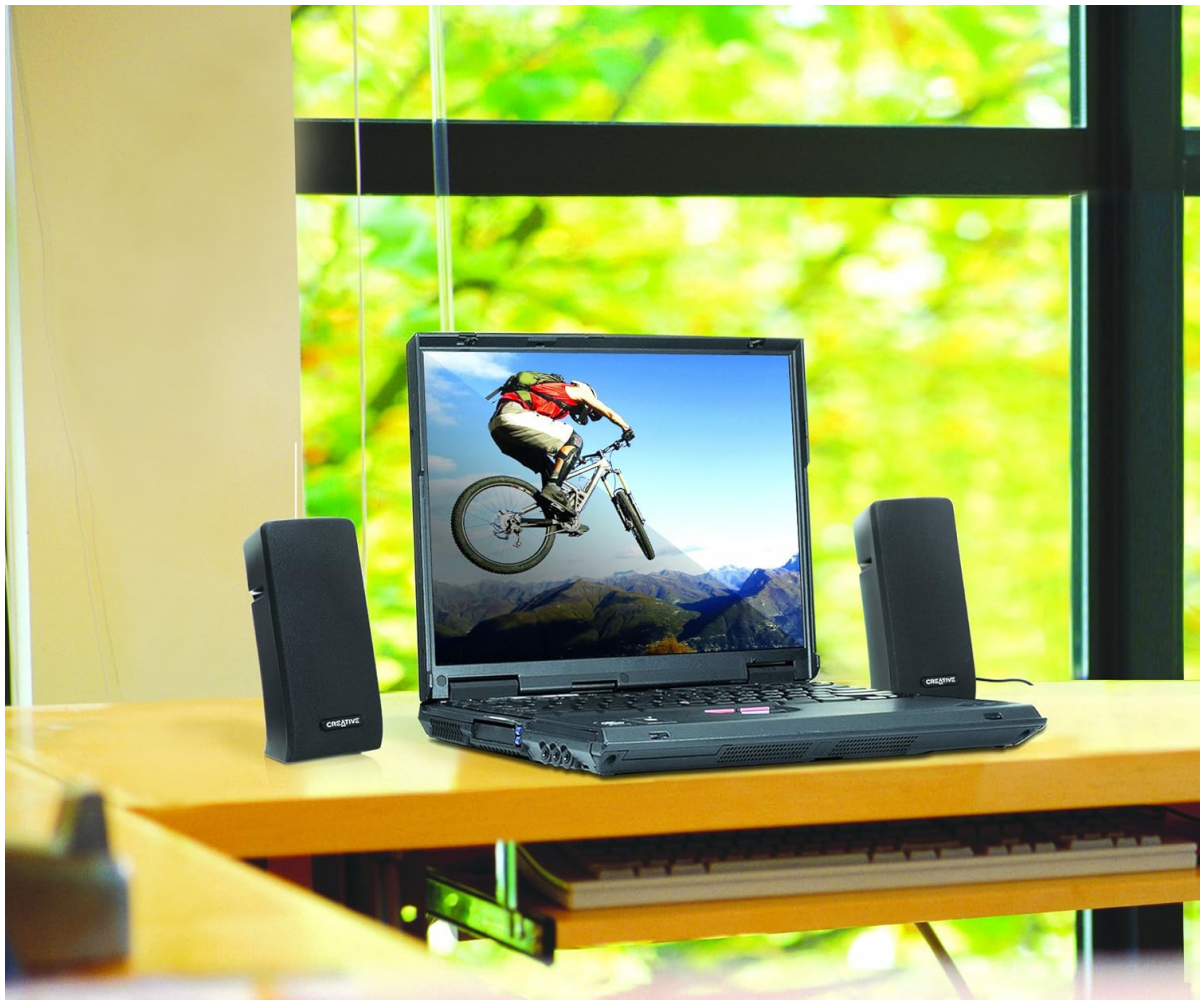
Image: The Creative A40 speakers positioned next to a laptop, demonstrating a typical usage scenario for personal audio playback.