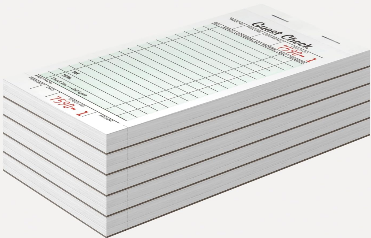
Image 4.1: Proper storage of multiple guest check pads, stacked neatly to maintain their form and quality.