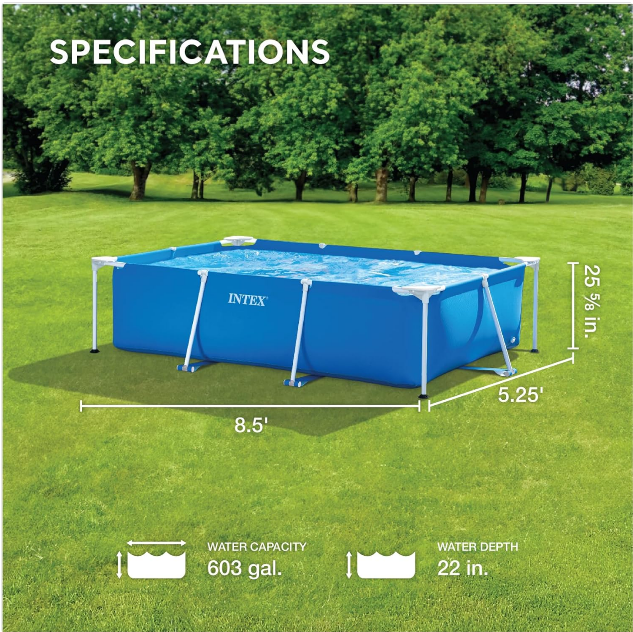
Image: Product dimensions and water capacity.