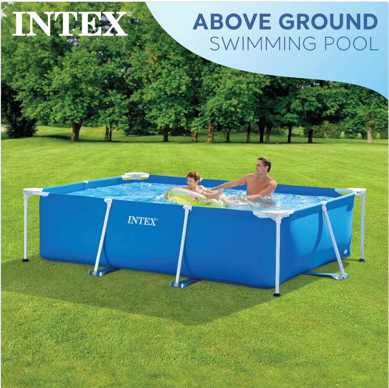
Image: Family enjoying the Intex Above-Ground Swimming Pool.