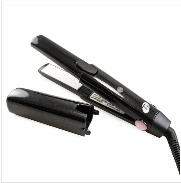
Figure 3.1: The T3 SinglePass Iron in its closed position, showing the main body and plates.