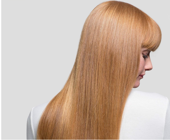
Figure 5.1: Example of hair styled with the T3 SinglePass Iron, demonstrating a shiny, smooth finish achieved by custom blend ceramic plates.

Custom blend ceramic plates for SHINY, SMOOTH FINISH