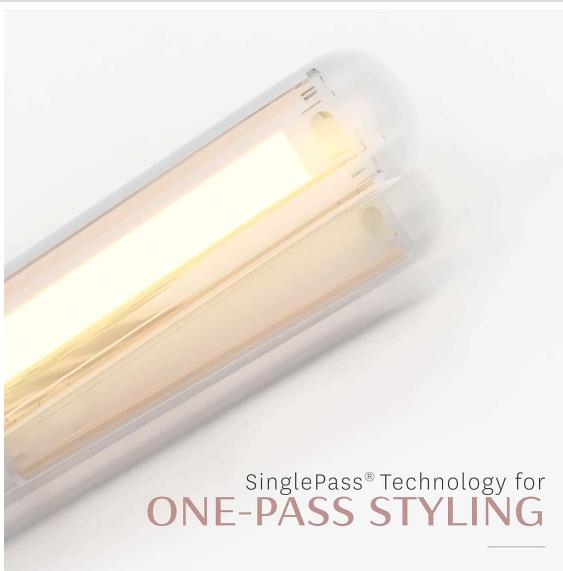
Figure 5.2: Illustration of the SinglePass® Technology, highlighting the efficient heating of the plates for one-pass styling.