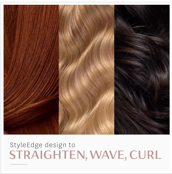
Figure 5.4: Visual representation of the versatility of the StyleEdge design, capable of straightening, waving, and curling various hair types.