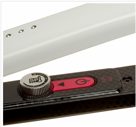
Figure 3.2: Close-up view of the temperature control dial and power button located on the iron's handle.