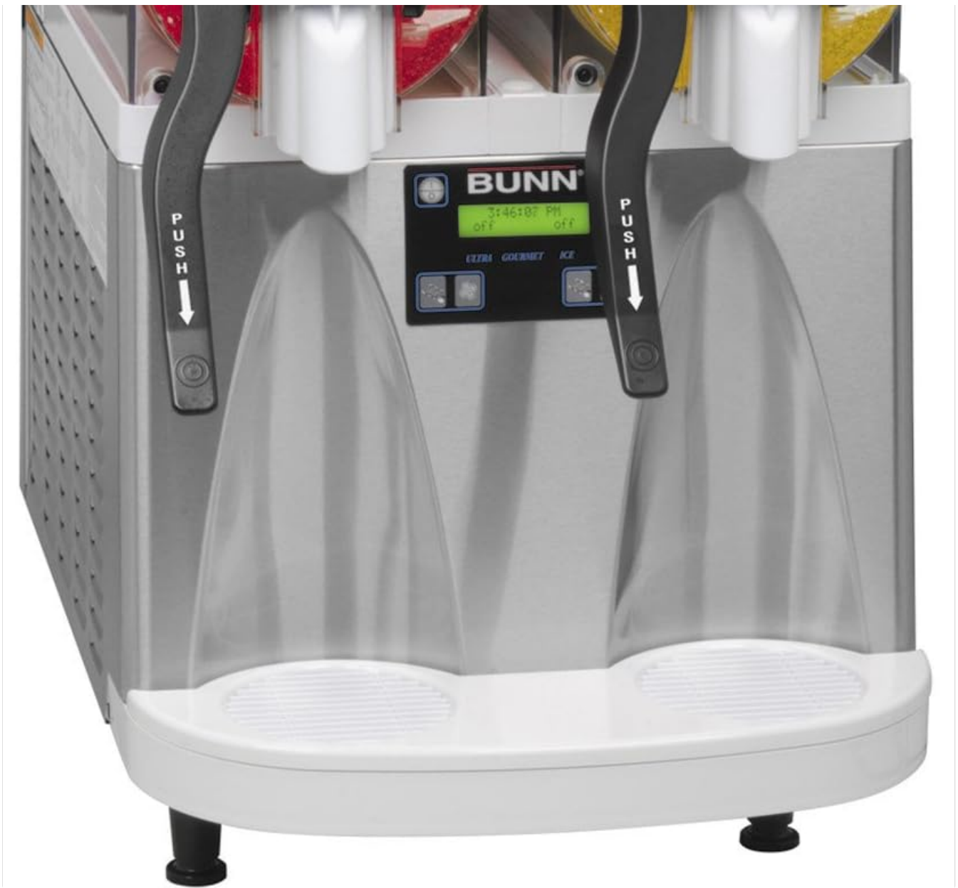
Figure 1: Front view of the BUNN ULTRA-2 Frozen Beverage System, showcasing its dual hoppers and control panel.