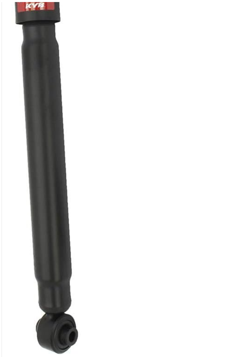
Image 1: The KYB 349068 Excel-G Gas Shock, a direct OEM replacement component.