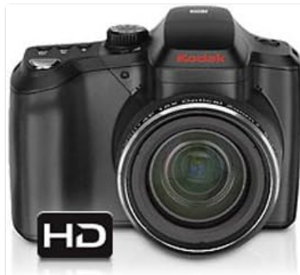
Figure 1: Front view of the Kodak EASYSHARE Z1015 Digital Camera, showcasing its lens and body design.

The Kodak EASYSHARE Z1015 is a versatile digital camera featuring a 10-megapixel CCD sensor, a 28mm wide-angle lens, and a powerful 15x optical zoom. It is designed to capture both expansive landscapes and detailed close-up shots with ease.