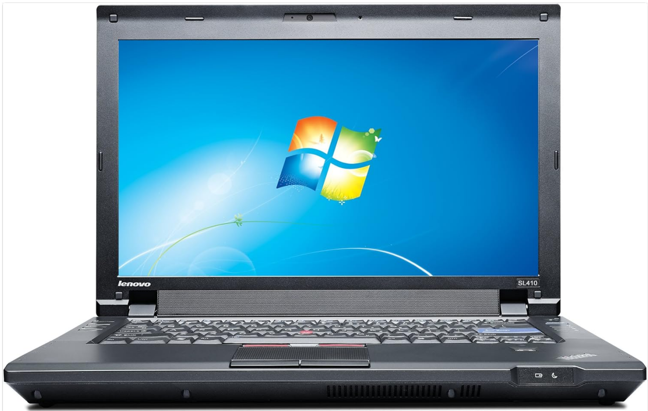
Figure 1: Front view of the Lenovo ThinkPad SL410 laptop with the screen displaying the Windows 7 operating system.