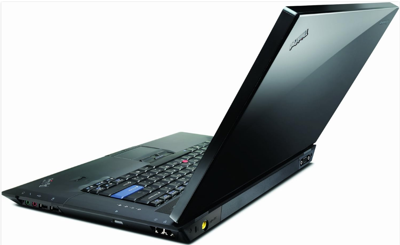
Figure 2: Side view of the laptop, illustrating the location of various ports, including the power input.