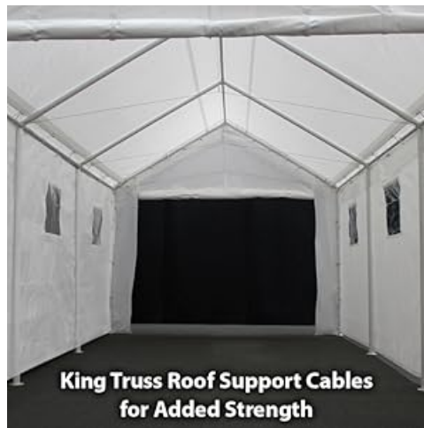
Image: Interior view of the Hercules 10x20 canopy, showing the roof support structure.