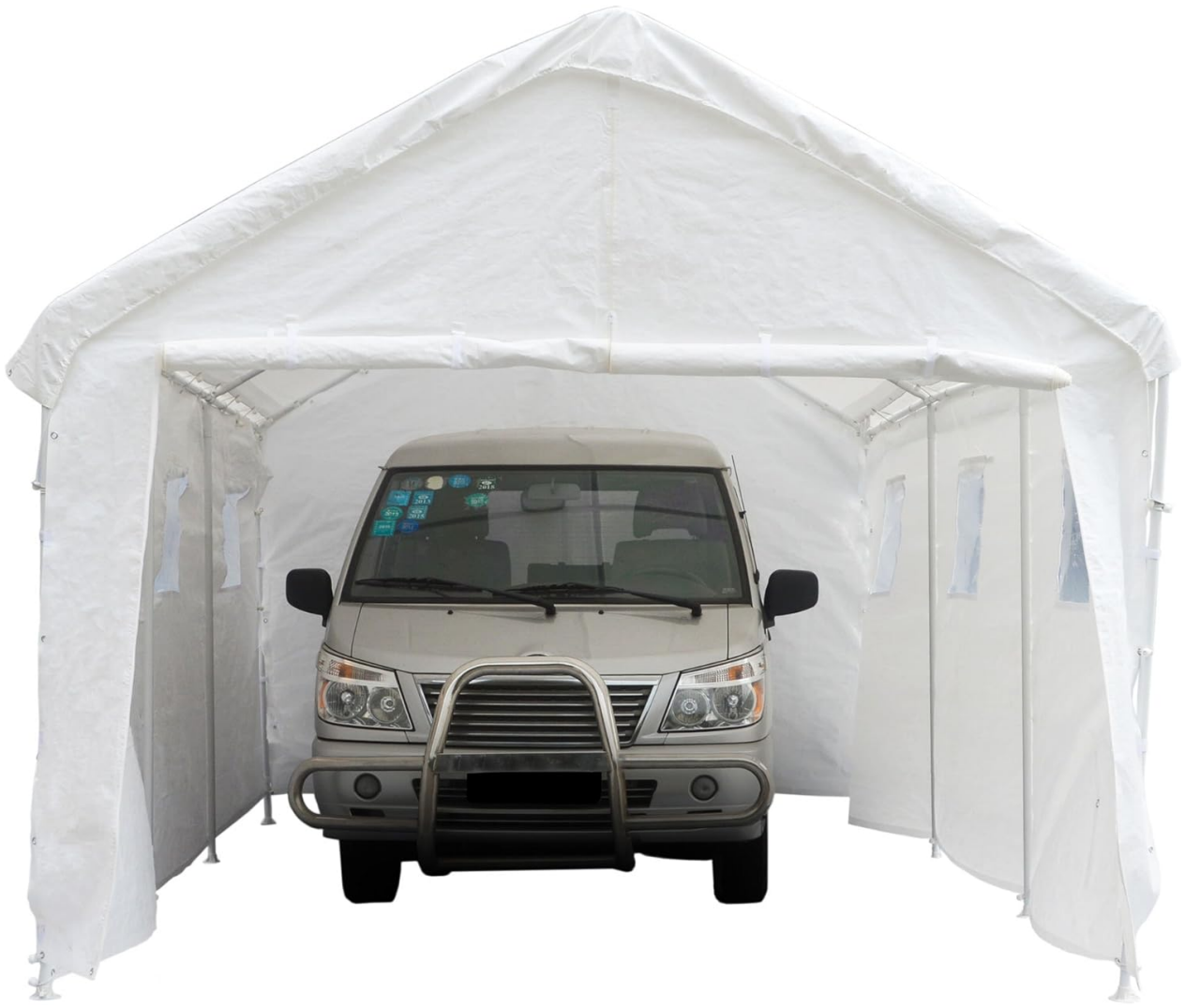
Image: The King Canopy Hercules providing shelter for a white van.