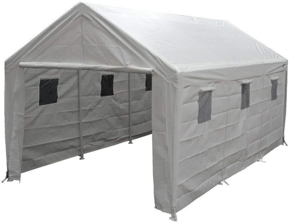
Image: The King Canopy Hercules 10x20 with Enclosure Kit, fully assembled.