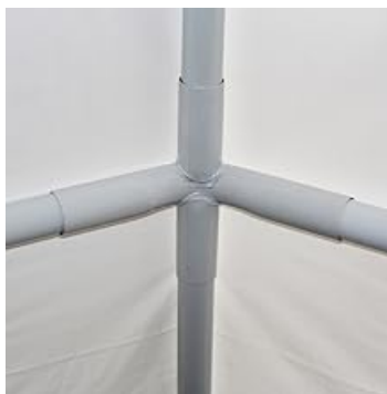
Image: Close-up of a 4-way fitting, illustrating a key connection point in the frame assembly.