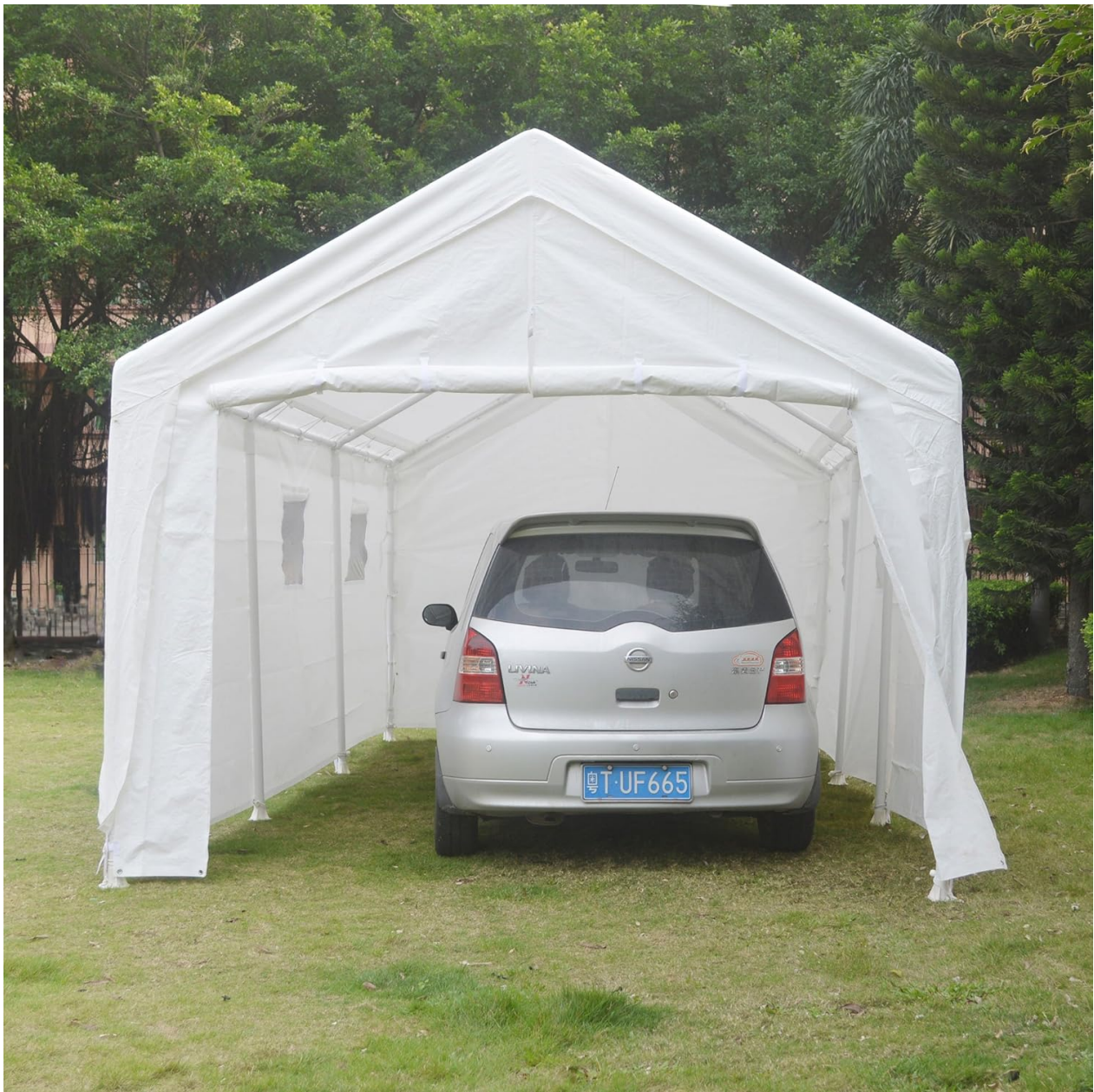
Image: The King Canopy Hercules providing shelter for a silver car.