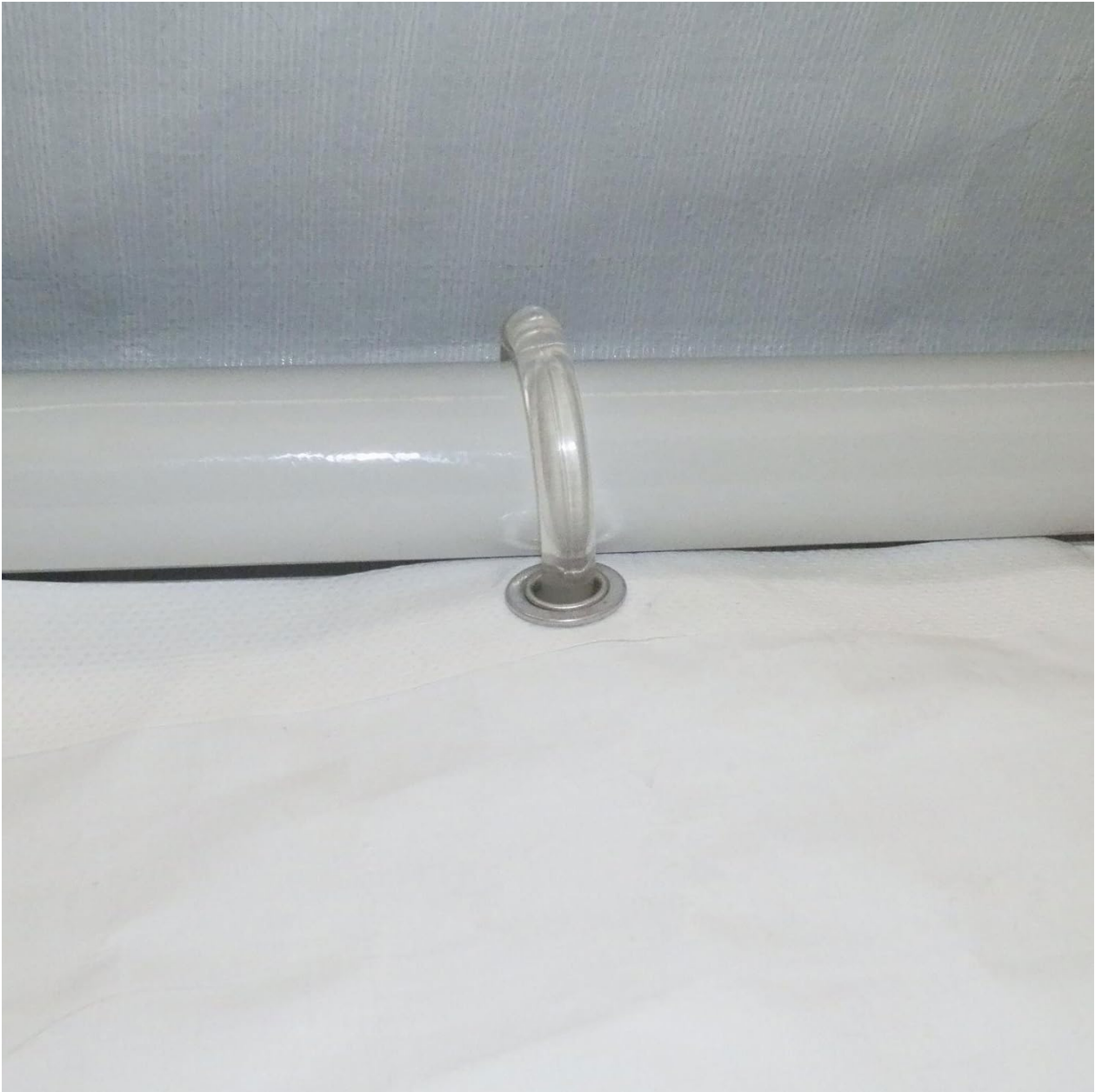
Image: A bungee ball securing the canopy cover to the frame.

Image: A 2-inch steel foot pad, designed for securing the canopy legs to the ground.