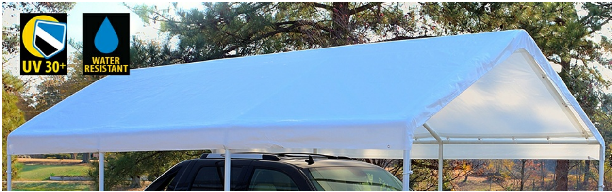
Image: Detail of the 180g Polyethylene cover, highlighting its UV resistant and 30+ UPF properties.