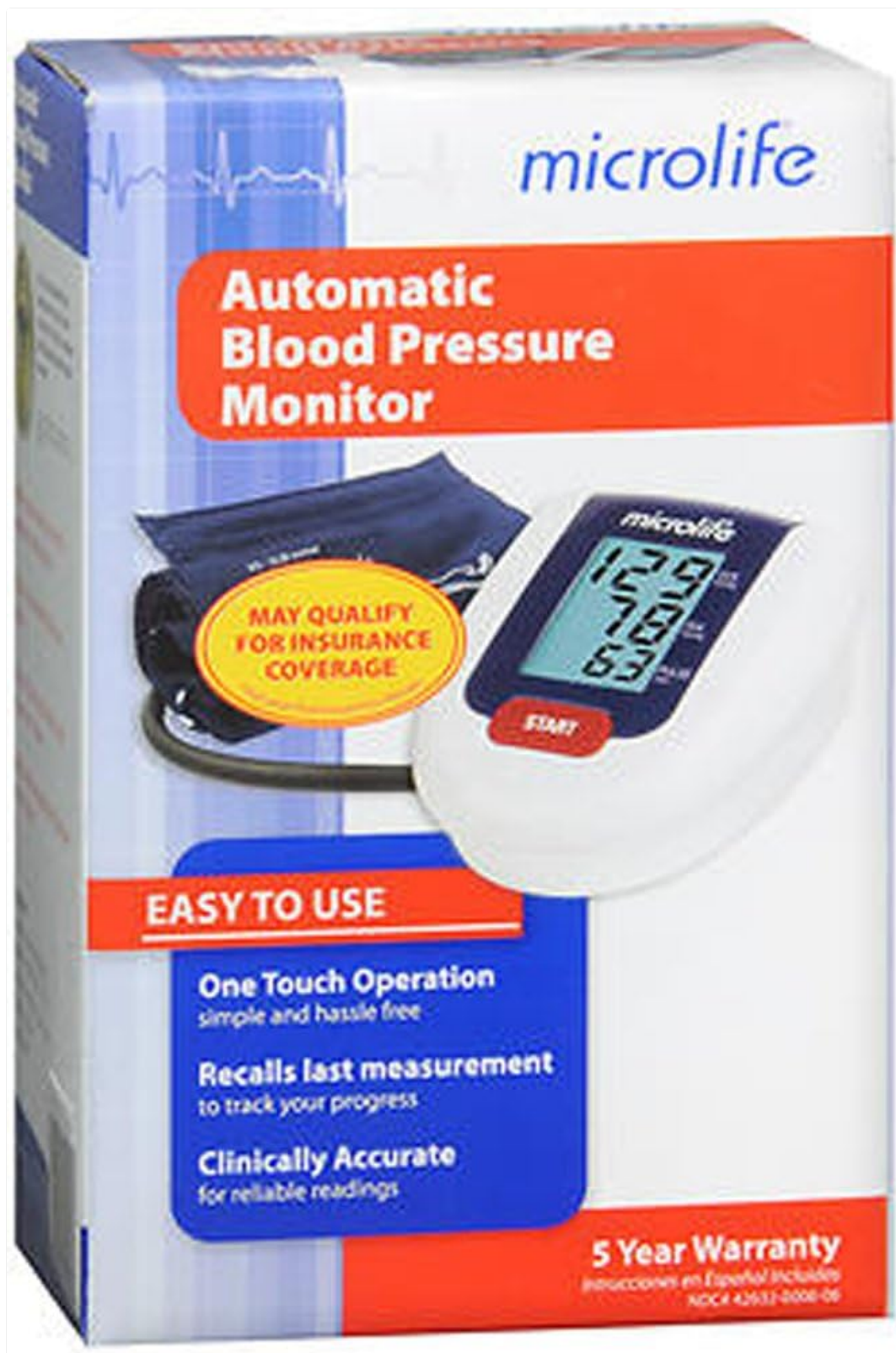
Image: The product packaging for the Microlife Automatic Blood Pressure Monitor, showing the device and cuff, highlighting features like "One Touch Operation" and "Clinically Accurate."