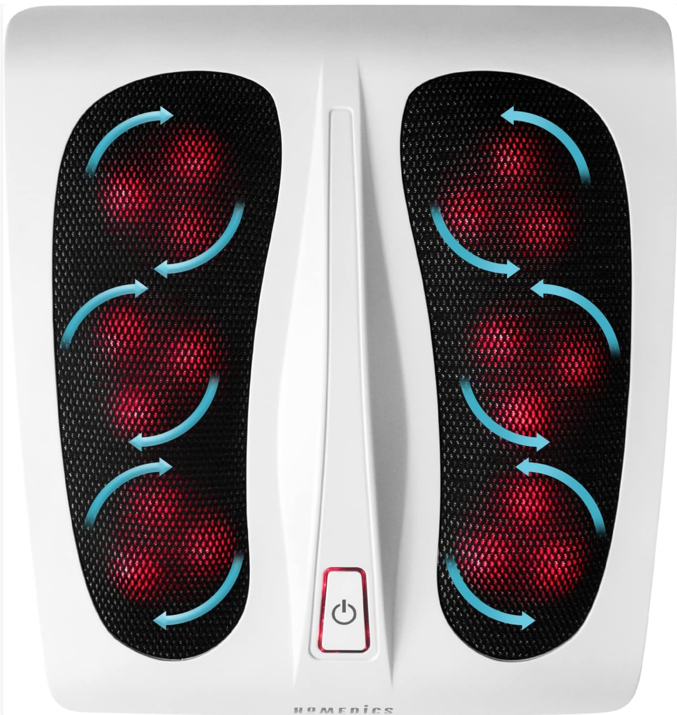
Image: The HoMedics FM-TS9-EU Electric Shiatsu Foot Massager, a white unit with black mesh footpads and a central power button.