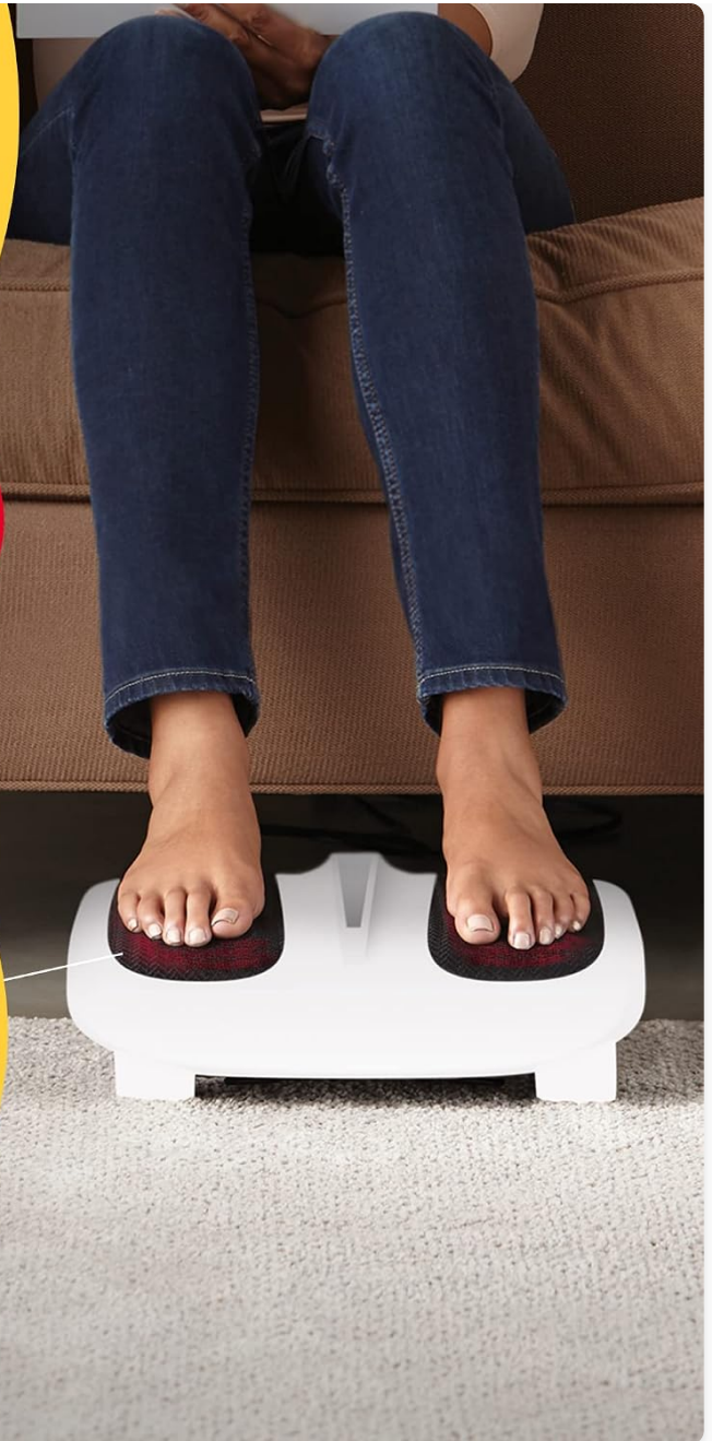
Image: A person using the massager, with a close-up inset showing the red glow of the soothing heat function softening stiff muscles.

The massager is equipped with an auto-shutoff feature that will turn off the device after approximately 15 minutes of continuous use. This is a safety feature and helps prevent overuse.