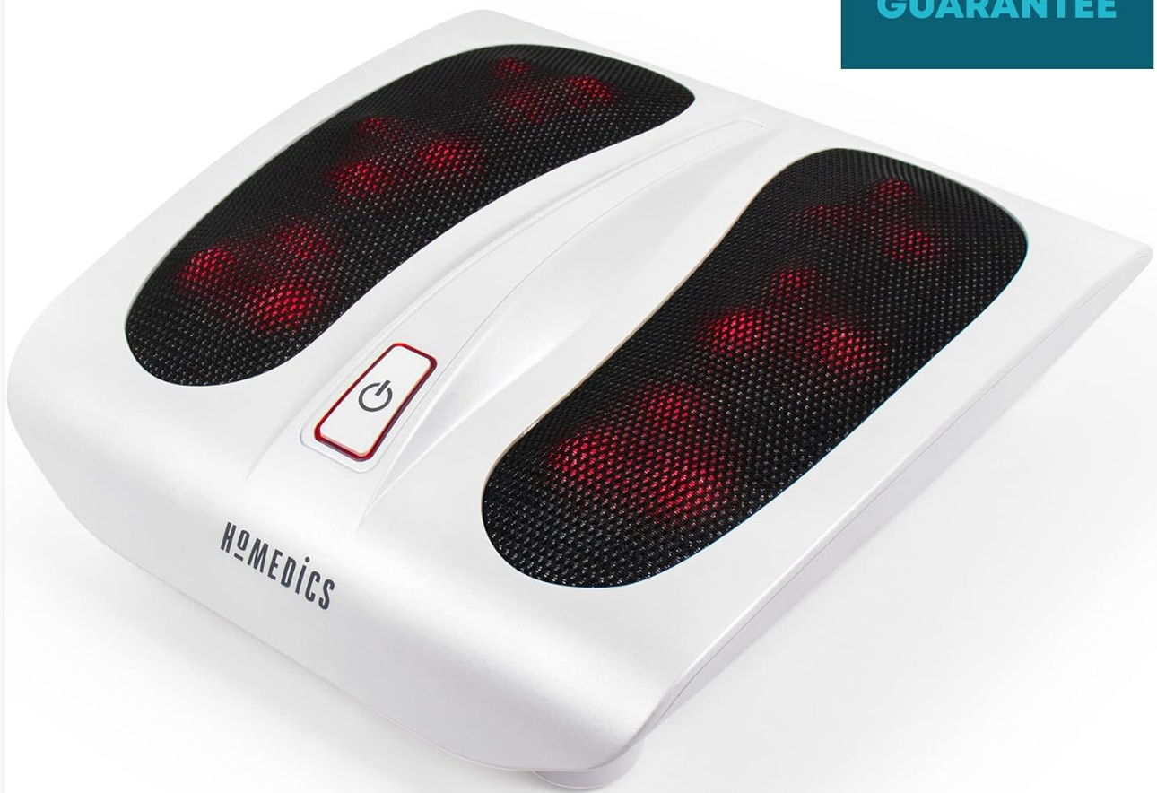
Image: The HoMedics foot massager shown with a '3 Year Guarantee' badge, indicating product reliability.