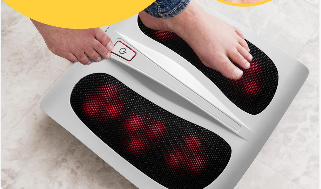
Image: A person's foot resting on the massager, highlighting the deep kneading Shiatsu massage mechanism that soothes tired, aching feet.