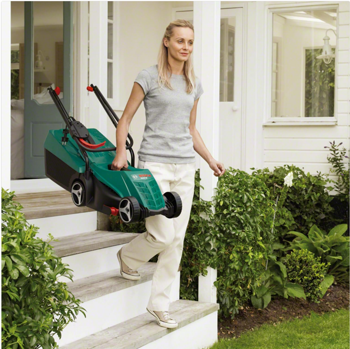
Figure 1: The Bosch Rotak 32 electric lawn mower is lightweight and easy to carry.