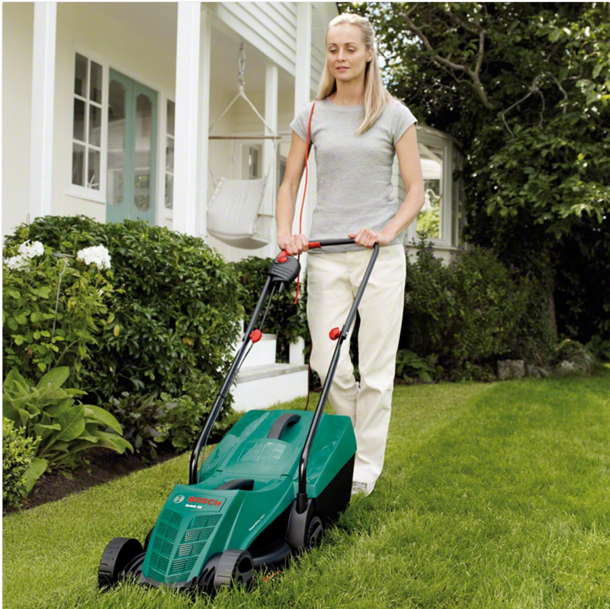
Figure 3: User operating the Bosch Rotak 32 lawn mower.