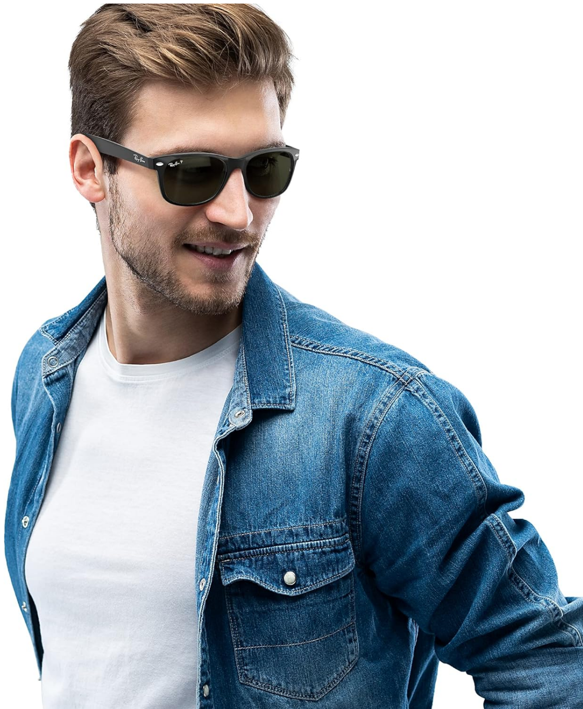
The Ray-Ban RB2132 New Wayfarer Square Sunglasses with their protective case, emphasizing proper storage.