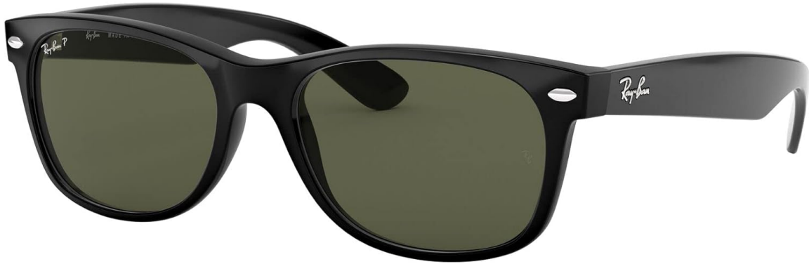
Side view of the Ray-Ban RB2132 New Wayfarer Square Sunglasses, highlighting the frame design.