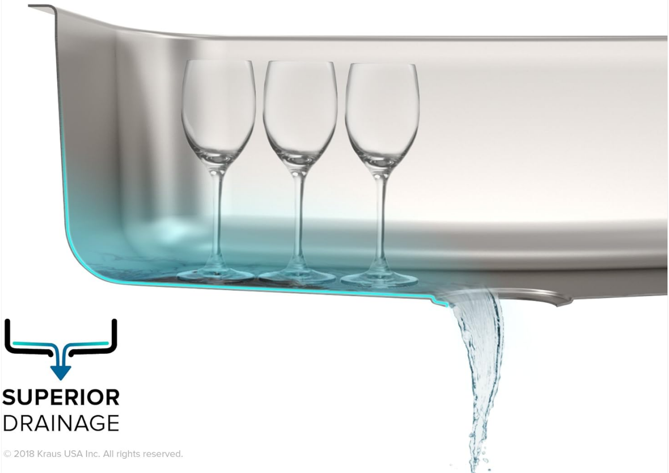
Figure 3: Engineered for Easy Draining

Gently sloped bottom allows for easy drainage, preventing standing water inside the basin. Optimized angle keeps glassware from falling when placed in the sink