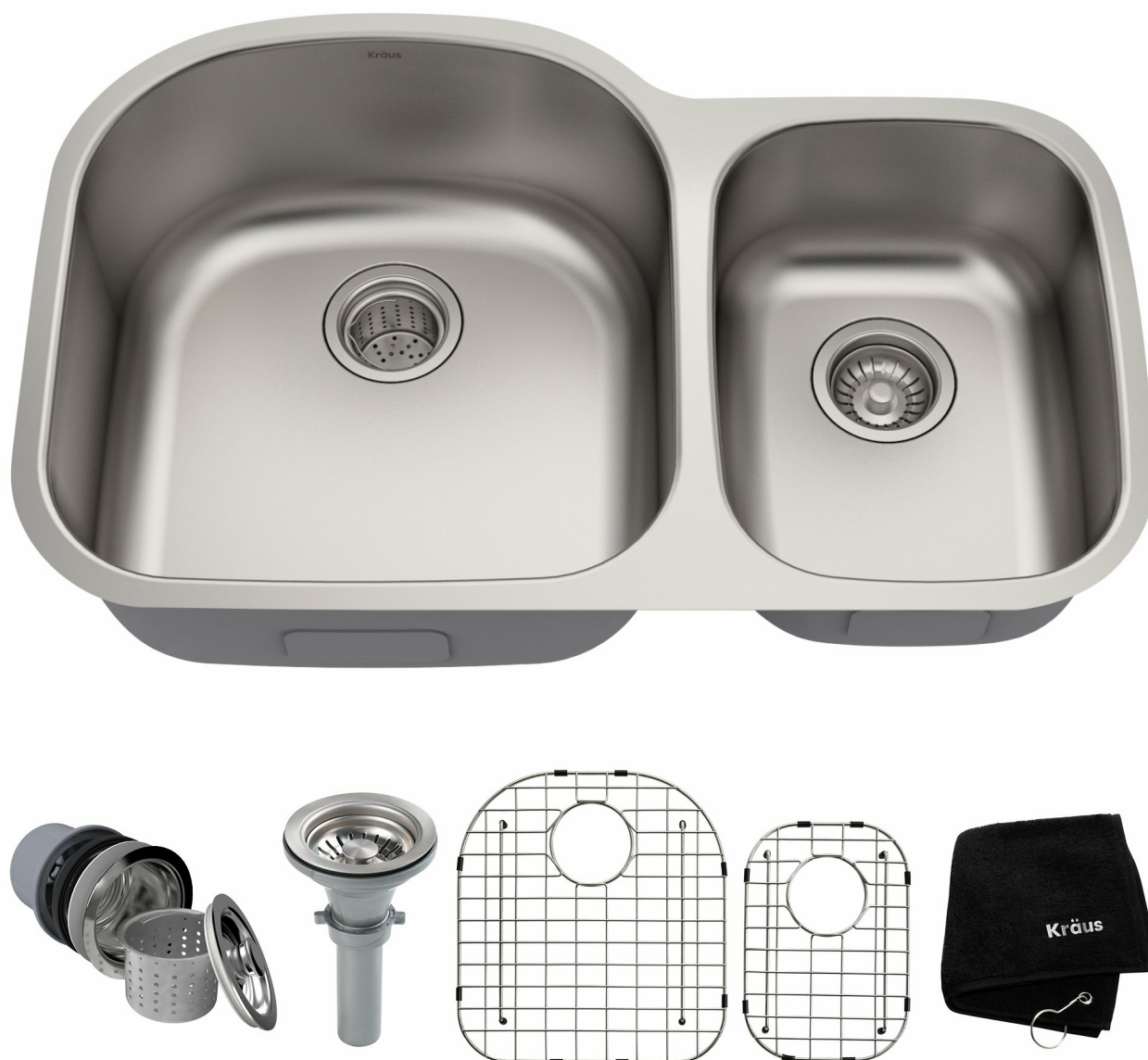
Figure 1: Kraus KBU23 Double Bowl Stainless Steel Sink