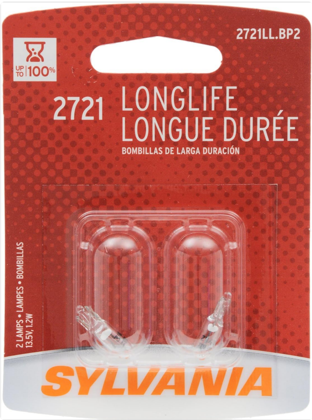
Image: Packaging for the SYLVANIA 2721 Long Life Miniature Bulb, containing two bulbs.

The SYLVANIA Long Life Mini Bulb is engineered for various automotive lighting applications, offering increased bulb life. These lamps are designed to withstand road shock and vibration, featuring a robust filament and proprietary gas mixture for extended durability and reduced maintenance. They are legal for on-road use and are manufactured by an Original Equipment (OE) Manufacturer.