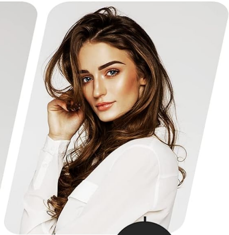
Black Reflector Reduces light and create shadows in certain areas