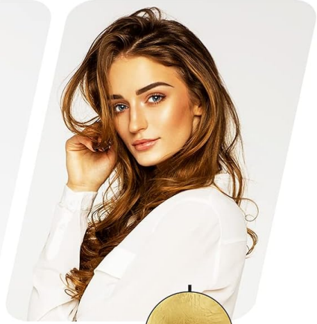
Gold Reflector Works basically the same way while adding a warmer color to the image