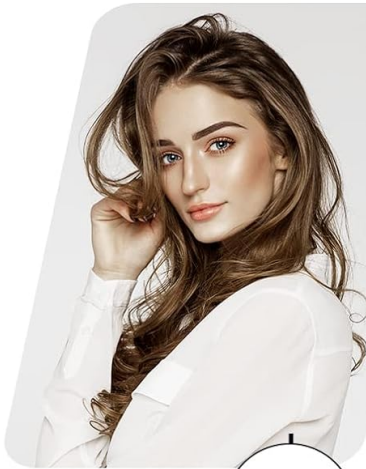
White Reflector Helps reduce shadows to produce a softer light