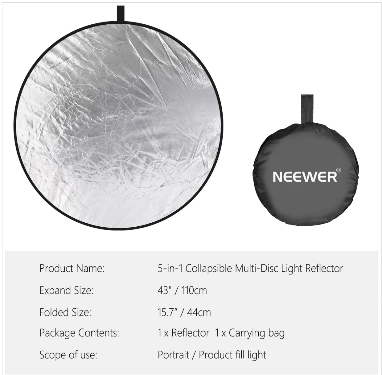
Figure 6: Detailed product information including dimensions, weight, and package contents.