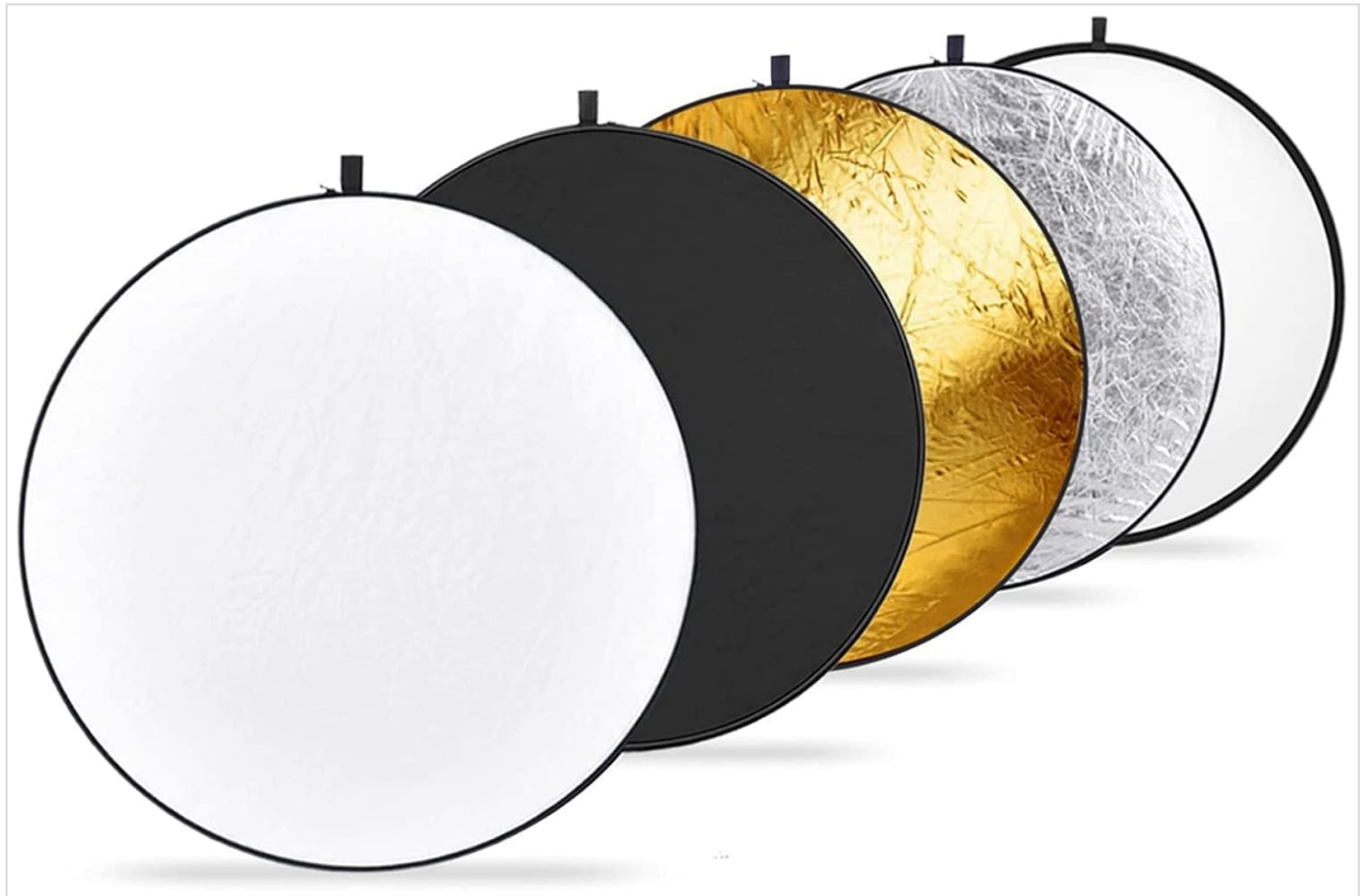
Figure 1: The NEEWER 5-in-1 Light Reflector showcasing its translucent core and various reflective covers.