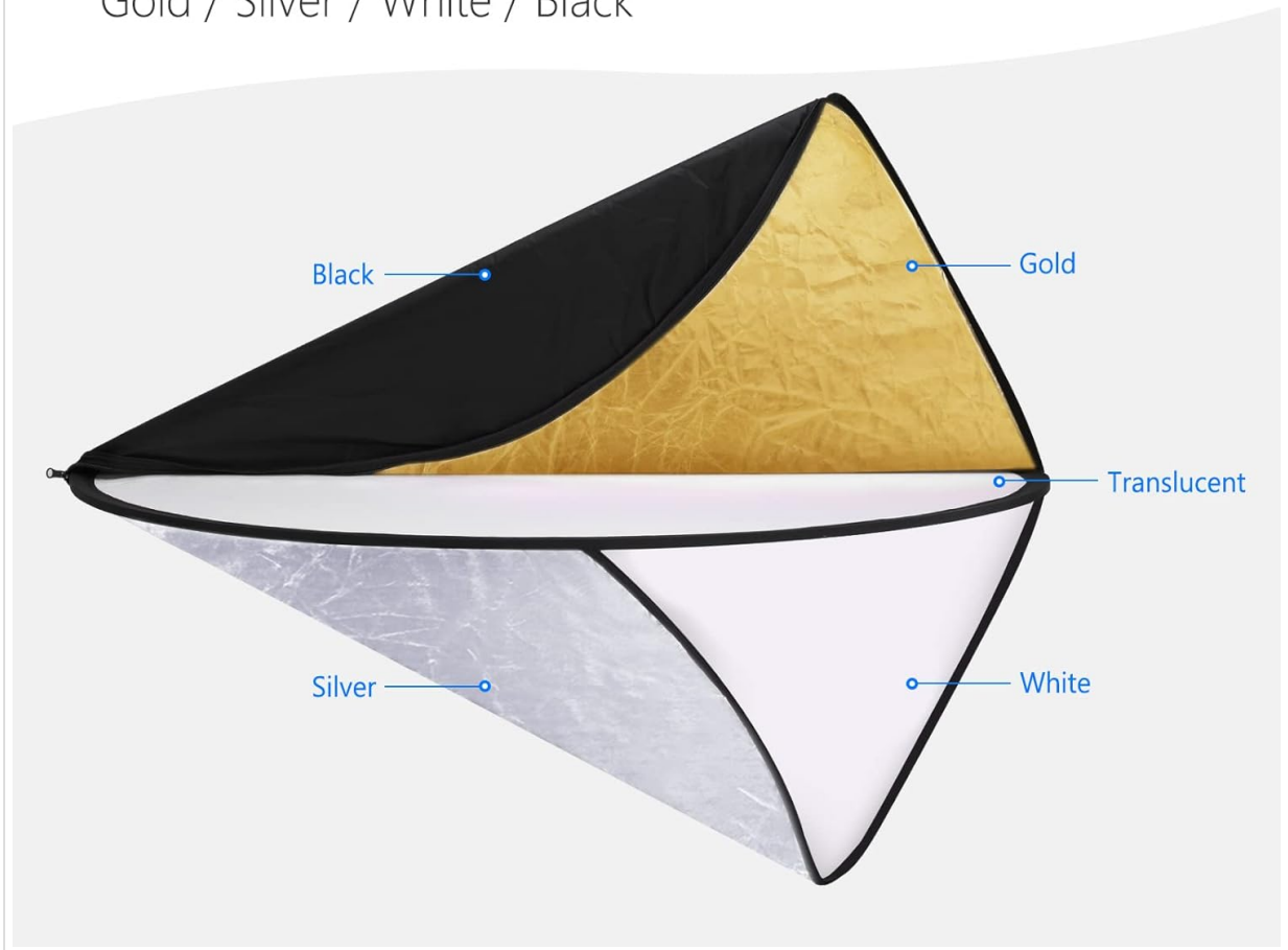
Figure 2: Illustration of the reflector's construction, highlighting the translucent panel and the zippered cover with gold, silver, white, and black surfaces.