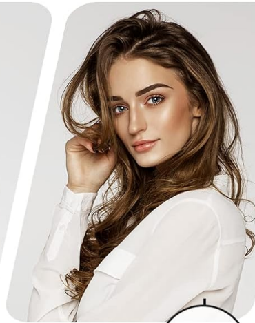
Translucent Reflector Typically positioned above the subject to soften the sun's natural light