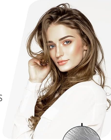
Silver Reflector Highly reflective - helps reduce shadows and highlights