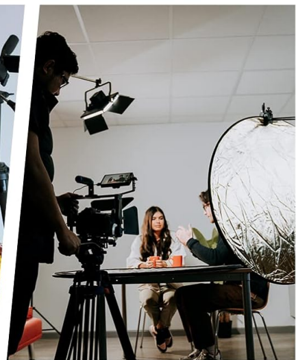
Figure 4: Examples of the reflector in use for outdoor shooting, product photography, and video production, demonstrating its versatility.