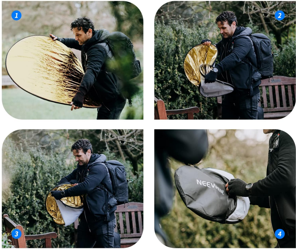
Figure 5: A visual guide demonstrating the four steps to collapse the reflector into its portable carrying pouch.

- Can be folded into an easy-to-carry pouch for added convenience -