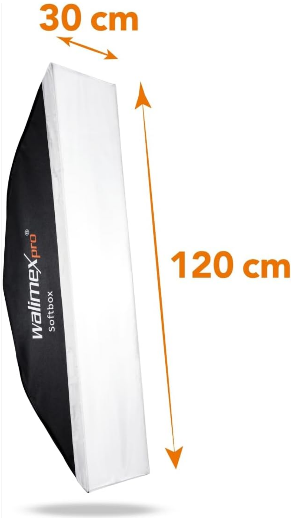
Image 1.1: The Walimex Pro 30x120cm Striplight, illustrating its dimensions of 30cm width and 120cm length.