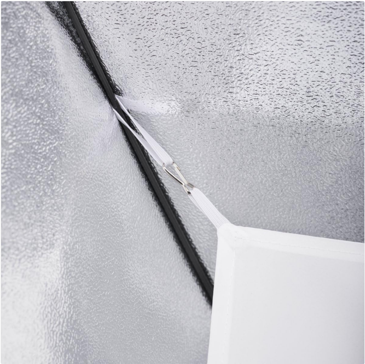
Image 4.3: Detail of how the internal diffuser is attached to the striplight's interior loops.