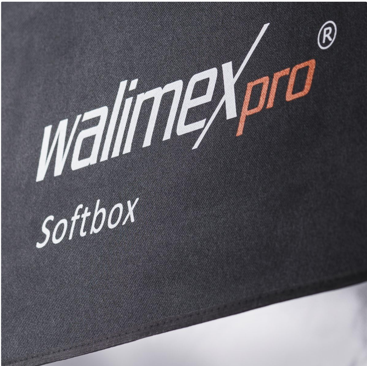
Image 1.2: Close-up view of the Walimex Pro branding on the softbox fabric.