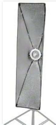
Image 4.1: Interior view of the striplight, illustrating the structure and points where assembly rods are inserted into the mounting ring.