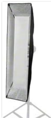
Image 4.4: The Walimex Pro Striplight fully assembled and mounted on a light stand, ready for use.