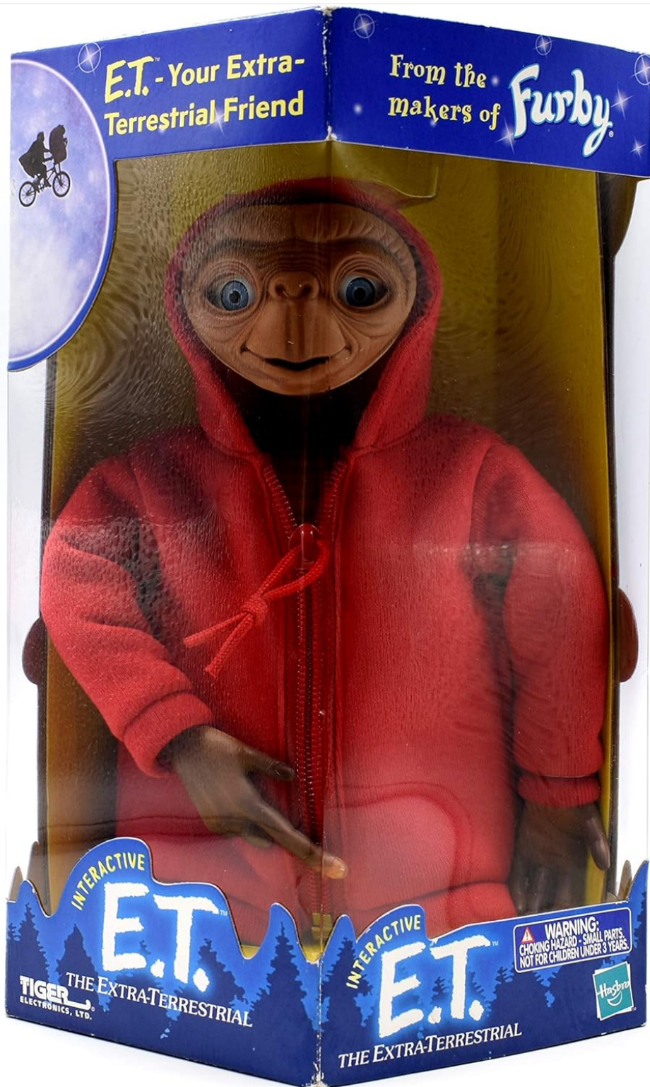
Figure 1: Front view of the E.T. Interactive Figure in its retail packaging. The packaging highlights "E.T. - Your Extra-Terrestrial Friend" and "From the makers of Furby," indicating its interactive nature and connection to the Furby line of toys. E.T. is visible wearing a red hooded jacket.