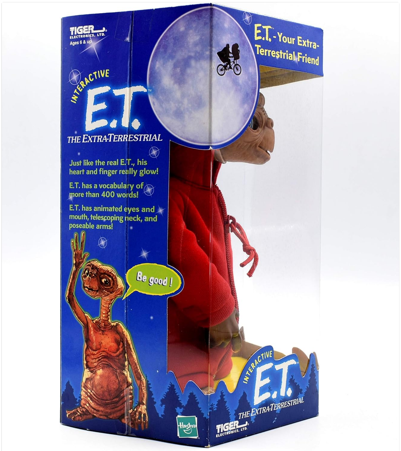
Figure 4: Opposite side view of the E.T. Interactive Figure in its retail packaging. This panel reiterates key features such as the glowing heart and finger, a vocabulary of over 400 words, and animated eyes, mouth, telescopic neck, and poseable arms. An illustration of E.T. with a speech bubble saying "Be good!" is also present.