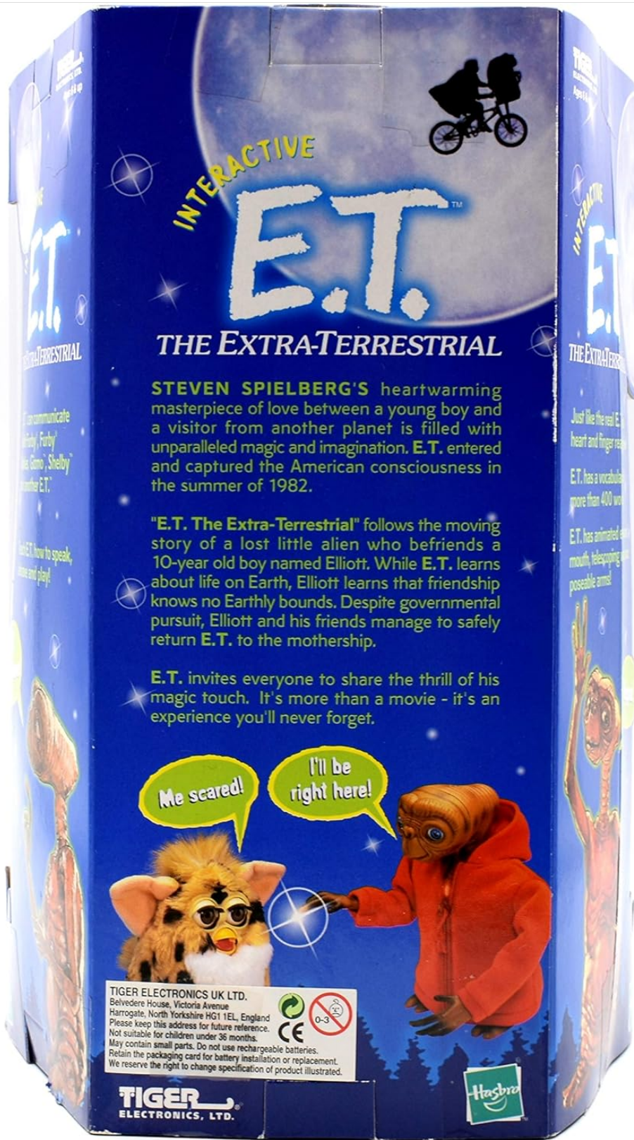
Figure 3: Back view of the E.T. Interactive Figure's retail packaging. This panel provides a synopsis of the E.T. story and includes quotes like "Me scared!" and "I'll be right here!" along with images of E.T. and a Furby, suggesting interaction between them. Manufacturer details and age recommendations are also visible.