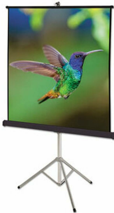
Image: The Quartet Portable Tripod Projection Screen fully set up and displaying a sample presentation. This shows the screen in its operational state.