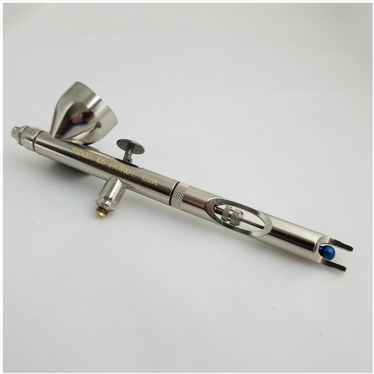
Figure 1: Front view of the Badger Air-Brush Co. Model 105 Patriot Airbrush.