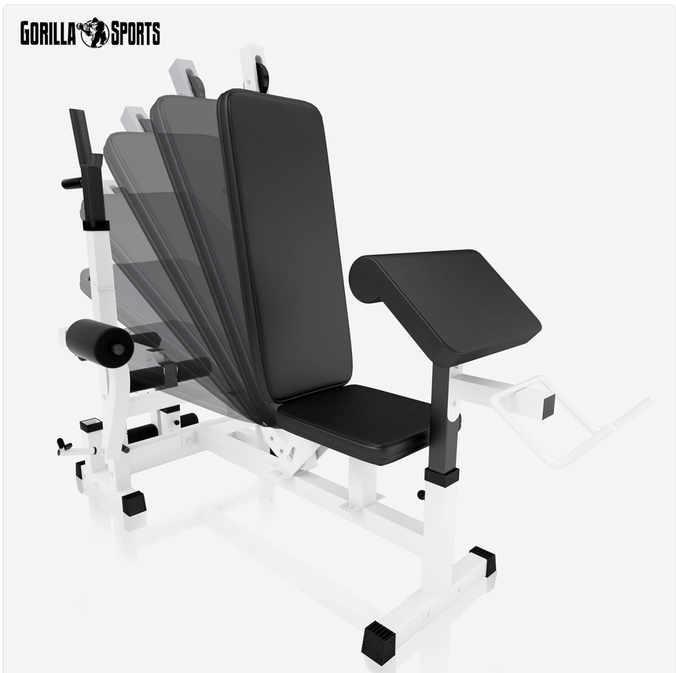
Figure 3: The adjustable backrest of the bench, demonstrating its multiple incline positions for varied exercises.