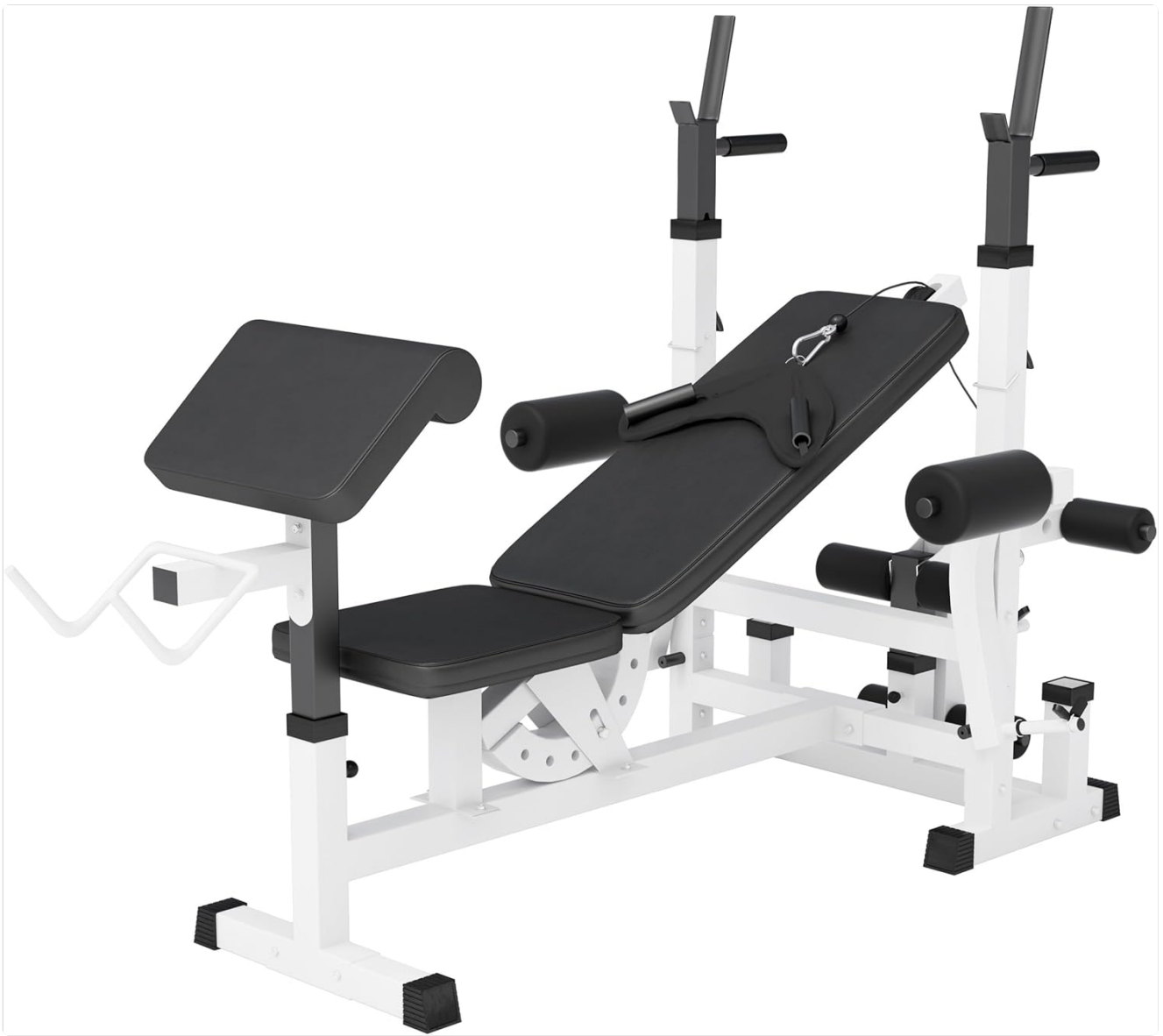
Figure 1: The Gorilla Sports Universal Weight Bench, showcasing its multi-functional design with barbell rests, a bench, and various attachments.