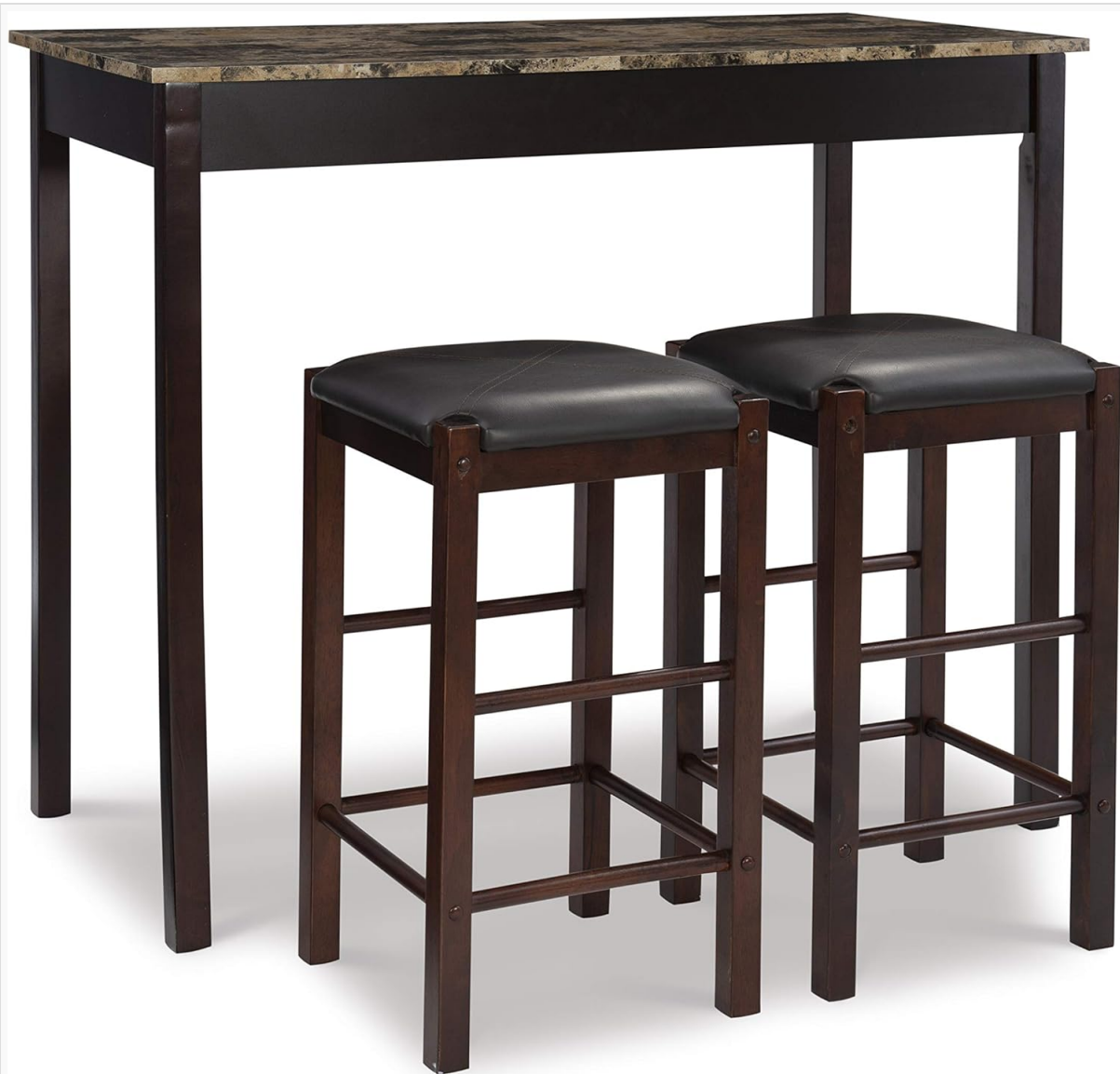
Image: The Linon Brown 3-Piece Faux Marble Tavern Set, featuring a rectangular table with a faux marble top and two matching backless stools with dark padded seats.