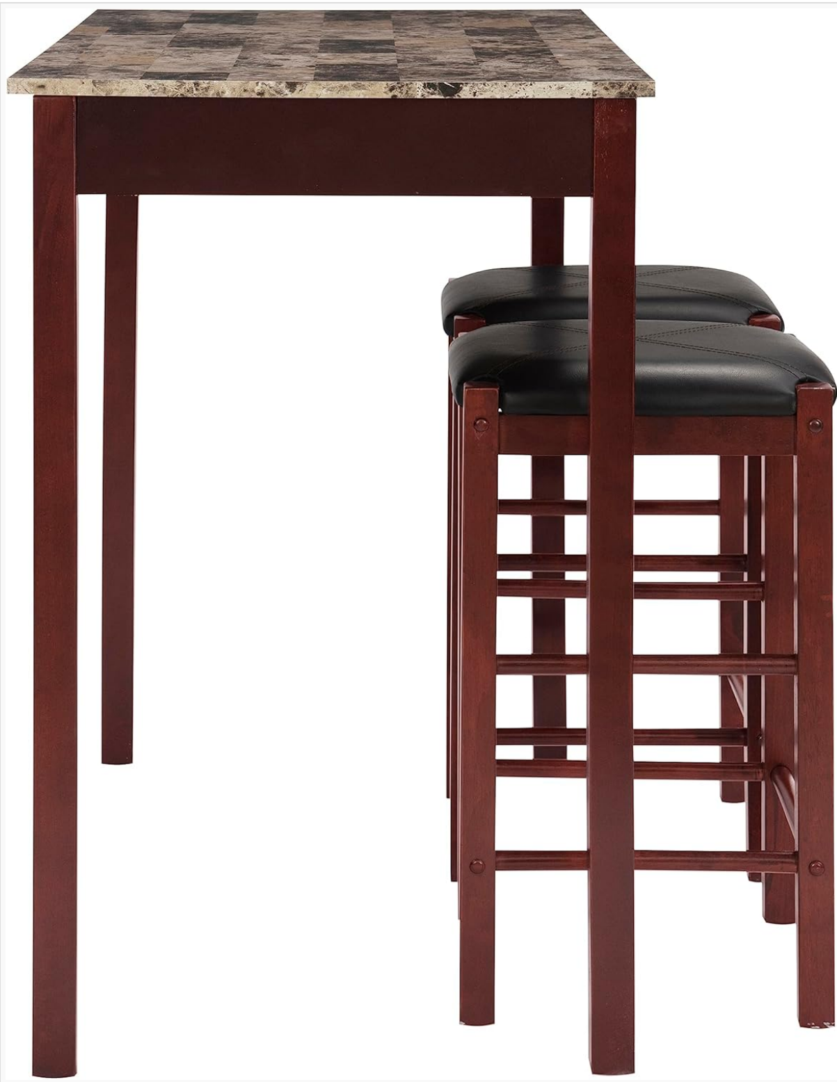
Image: The Linon Tavern Set positioned in a kitchen nook, demonstrating its space-saving design and suitability for smaller areas.