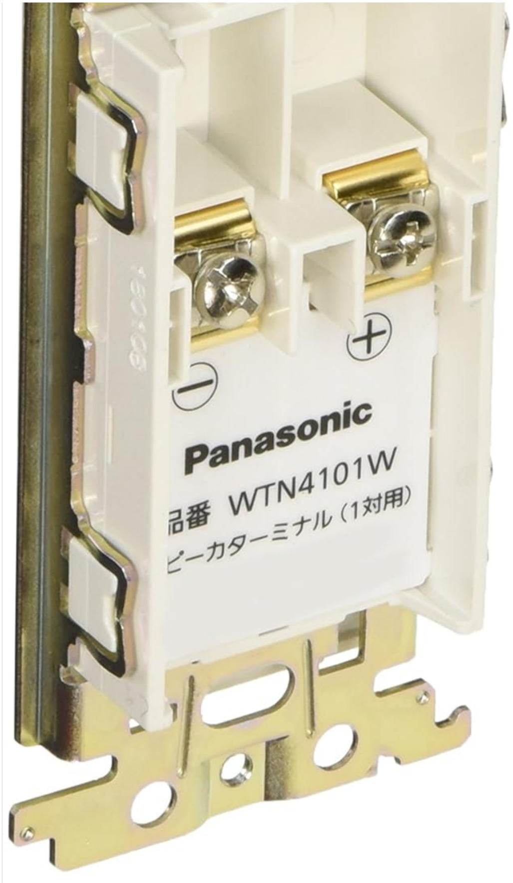
Figure 2.1: Front view of the Panasonic WTN4101W speaker terminal. This image displays the Panasonic WTN4101W speaker terminal, designed for wall installation. It features two gold-plated screw terminals for positive and negative speaker wire connections, mounted within a white housing and a metal bracket for secure fitting into a standard electrical box.