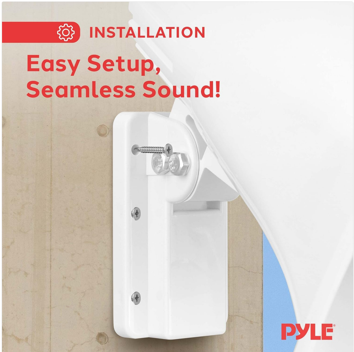
Image: Pyle PHSP5 Horn Speaker Installation. This image illustrates the mounting bracket being secured to a surface with screws, ready for the speaker to be attached.