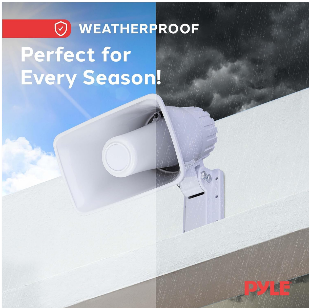
Image: Pyle PHSP5 Horn Speaker Weatherproof Design. This image highlights the speaker's ability to withstand various weather conditions, suitable for year-round outdoor installation.