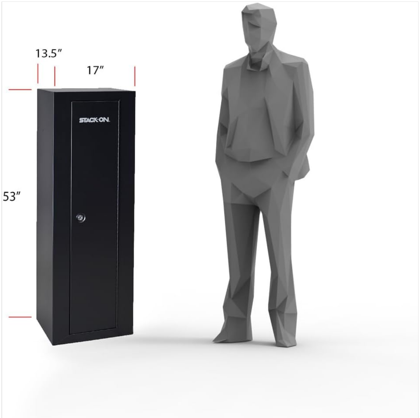
Image: A diagram illustrating the dimensions of the Stack-On GCB-910 cabinet (13.5"D x 17"W x 53"H) relative to a human figure.