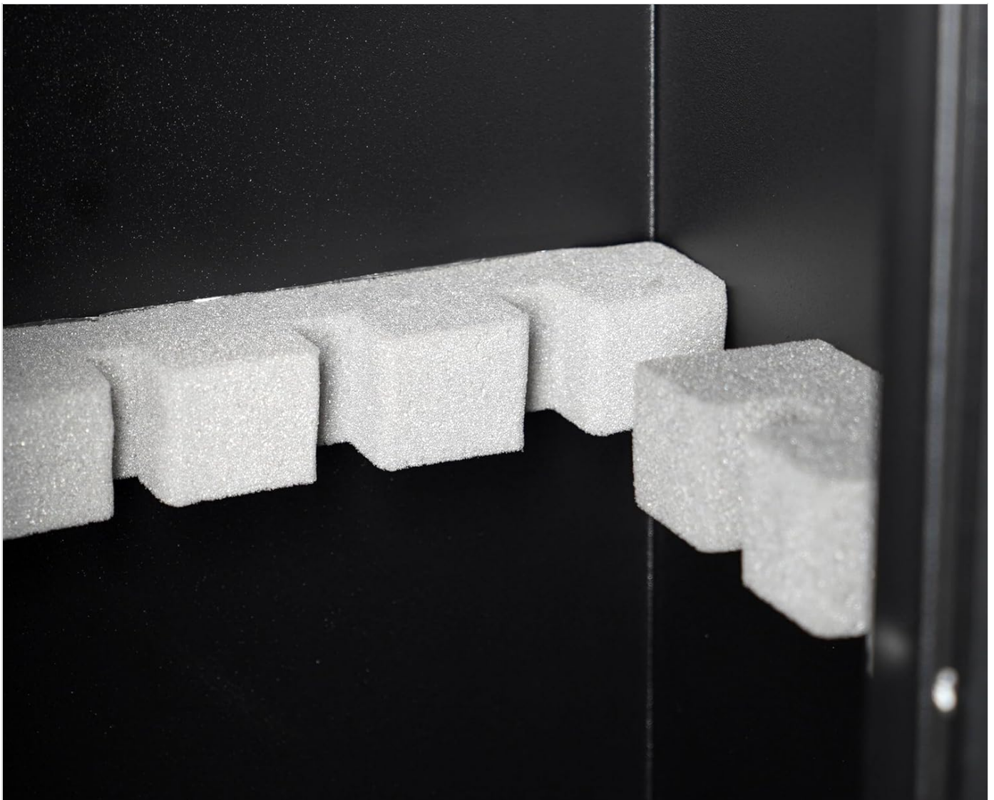
Image: A detailed view of the foam-padded barrel rests, designed to protect firearms from damage.