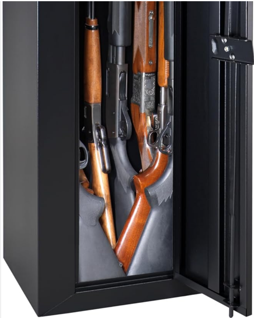
Image: Interior view of the cabinet demonstrating firearm storage with padded barrel rests and a top shelf.