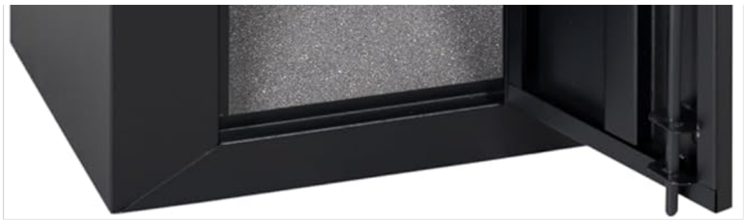
Image: The empty interior of the cabinet, showcasing the removable shelf and foam padding on the bottom and barrel rests.

Regular maintenance ensures the longevity and proper function of your security cabinet.