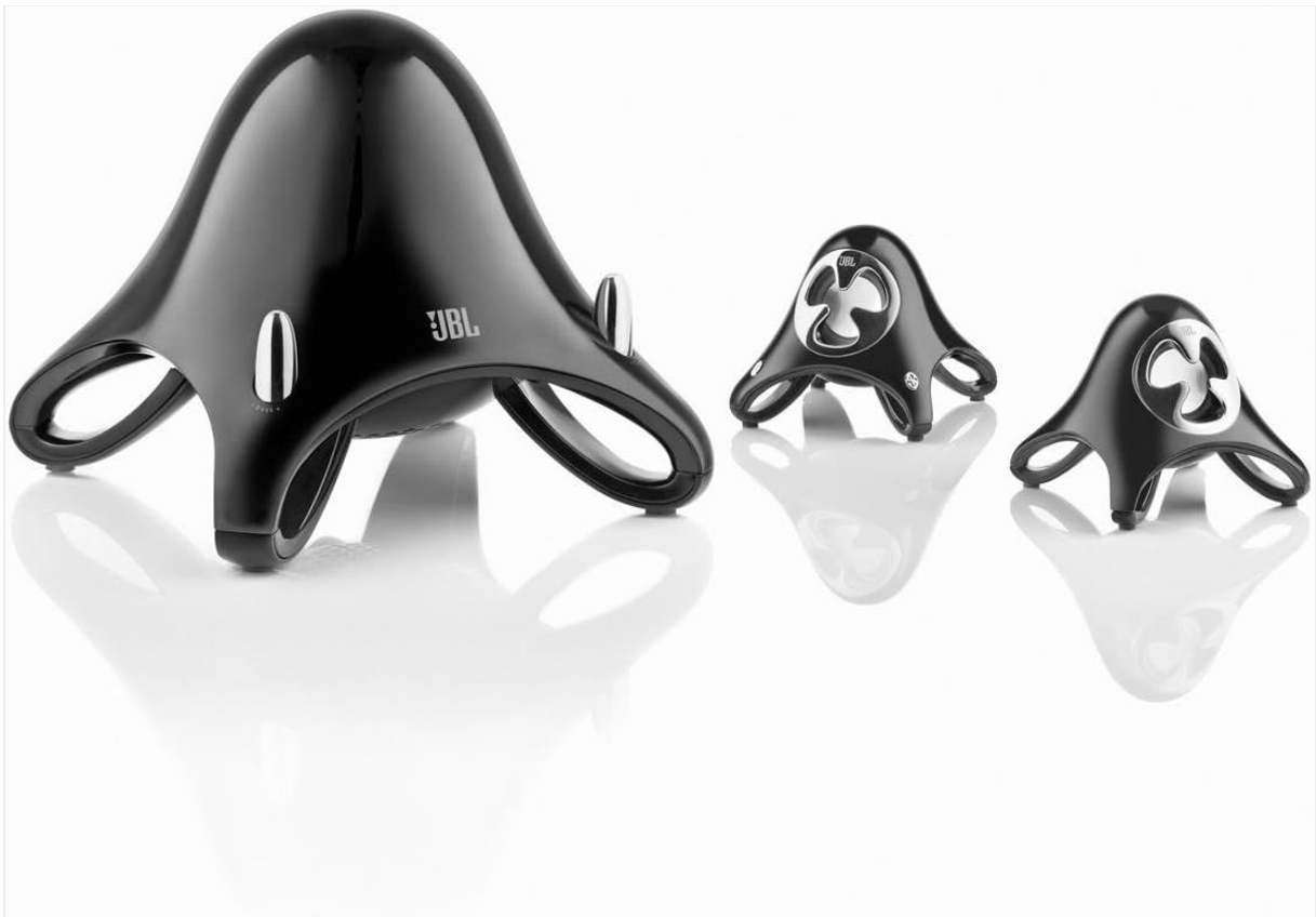
Image: All components of the JBL Creature III system, including the subwoofer, two satellite speakers, and connecting cables.