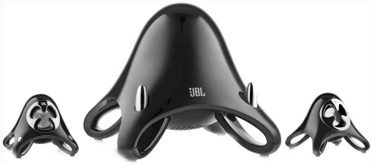
Image: The JBL Creature III subwoofer and two satellite speakers, illustrating a typical setup configuration.