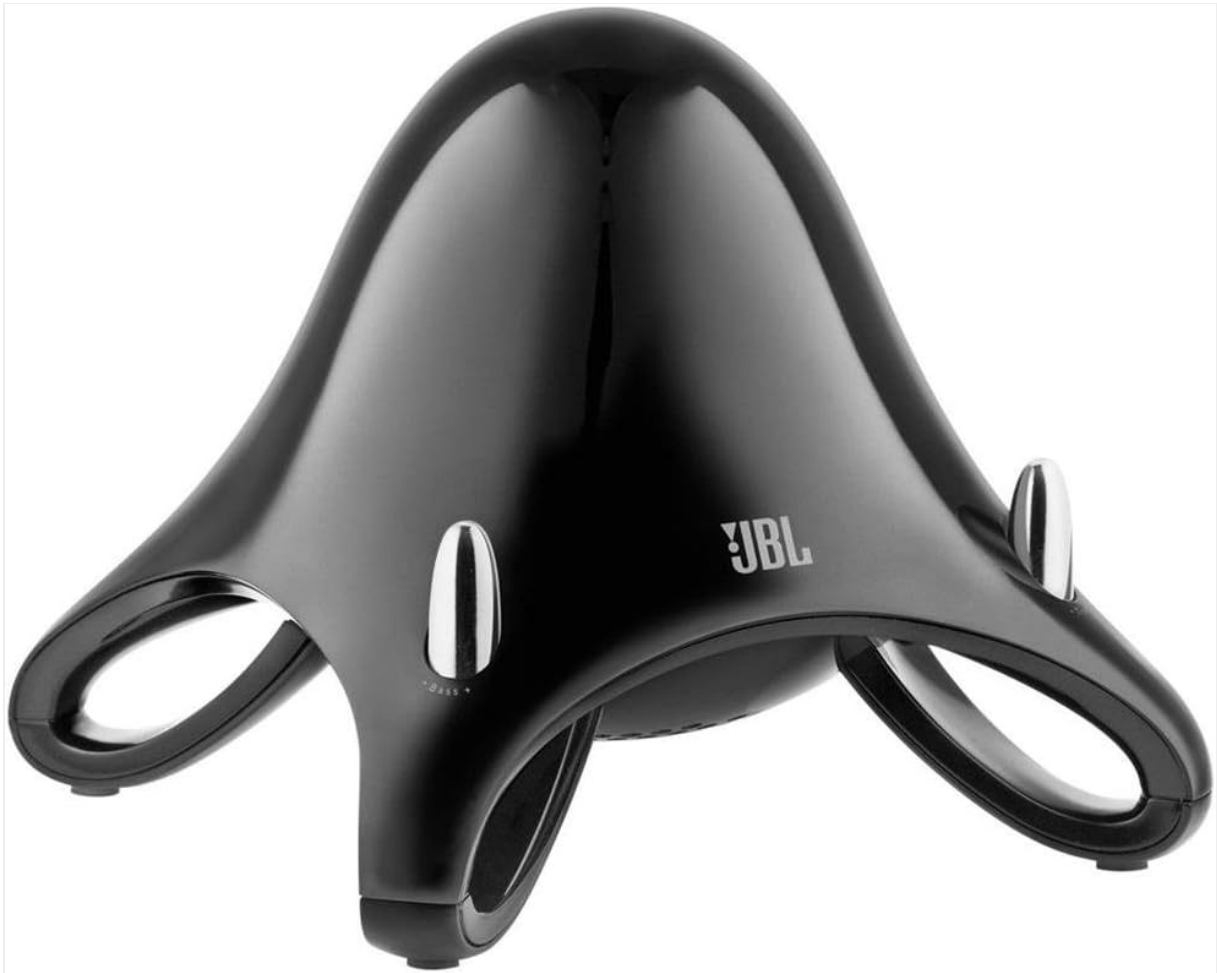
Image: A detailed view of one satellite speaker, highlighting the touch-sensitive volume controls.