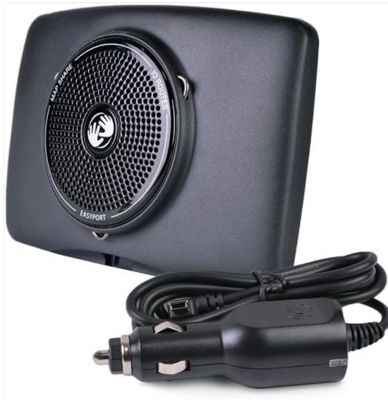
Figure 4: TomTom XL 340S device shown with its car charger and USB cable, essential for charging and updates.