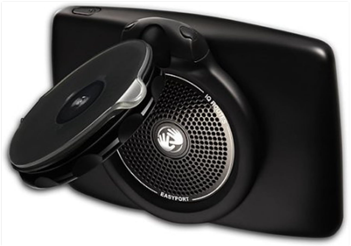
Figure 2: Rear view of the TomTom XL 340S, highlighting the EasyPort mounting system.