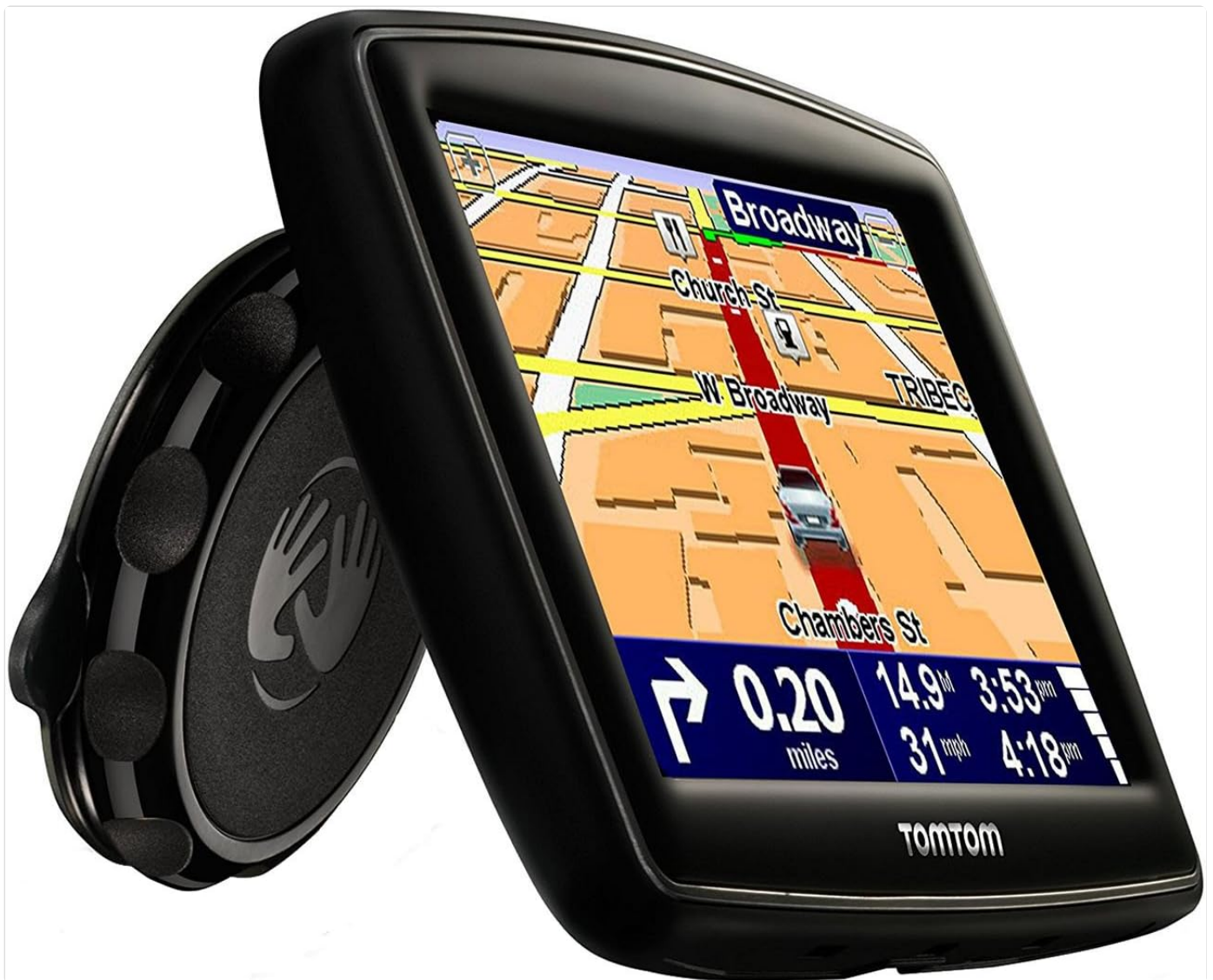
Figure 1: TomTom XL 340S mounted, showing the device's screen and its attachment to the mount.