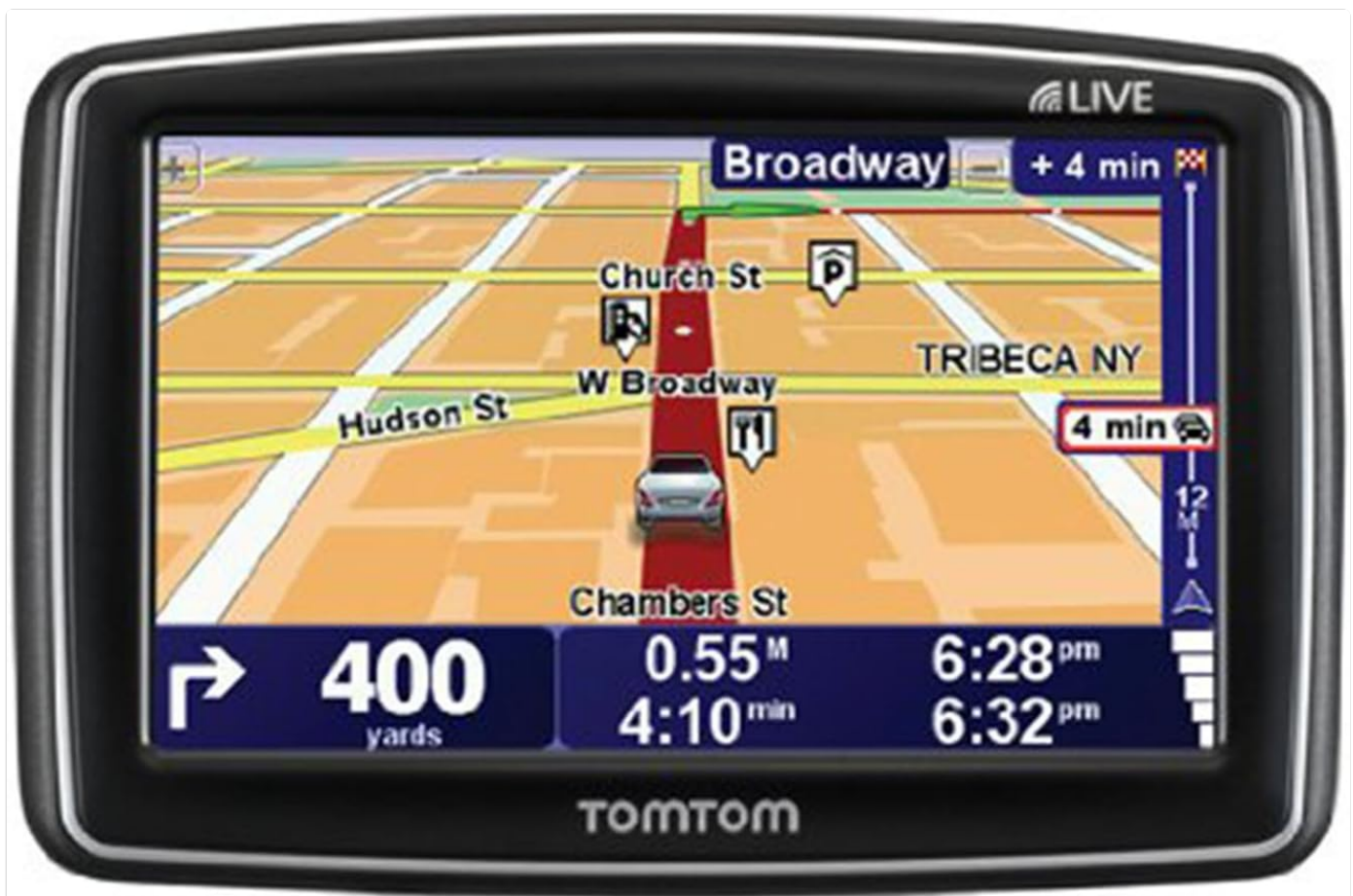
Figure 3: The TomTom XL 340S display showing an active navigation route with lane guidance and estimated arrival times.