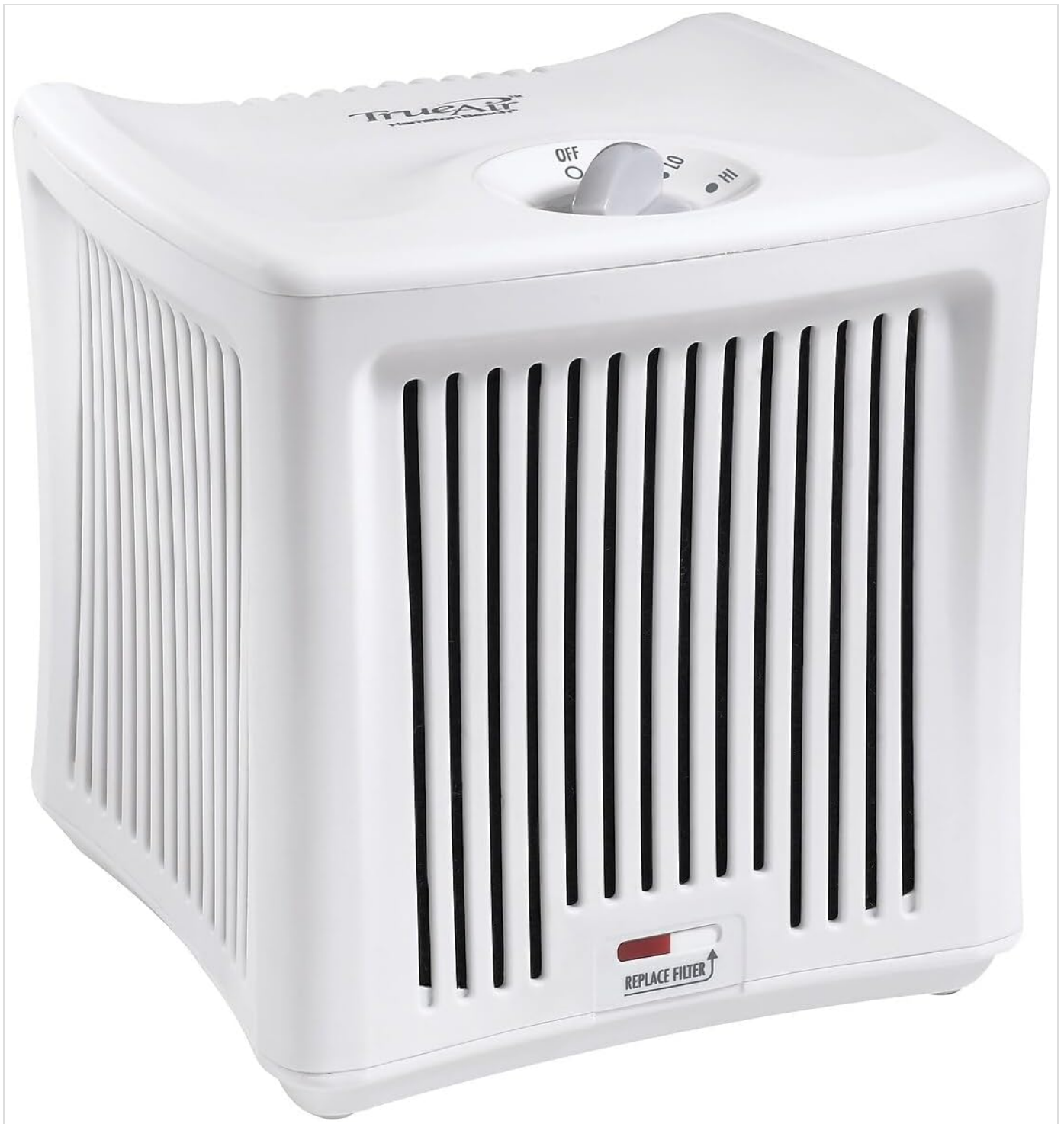
Image 1: Front view of the Hamilton Beach TrueAir 04532GM Room Odor Eliminator, showing the control dial and filter indicator.