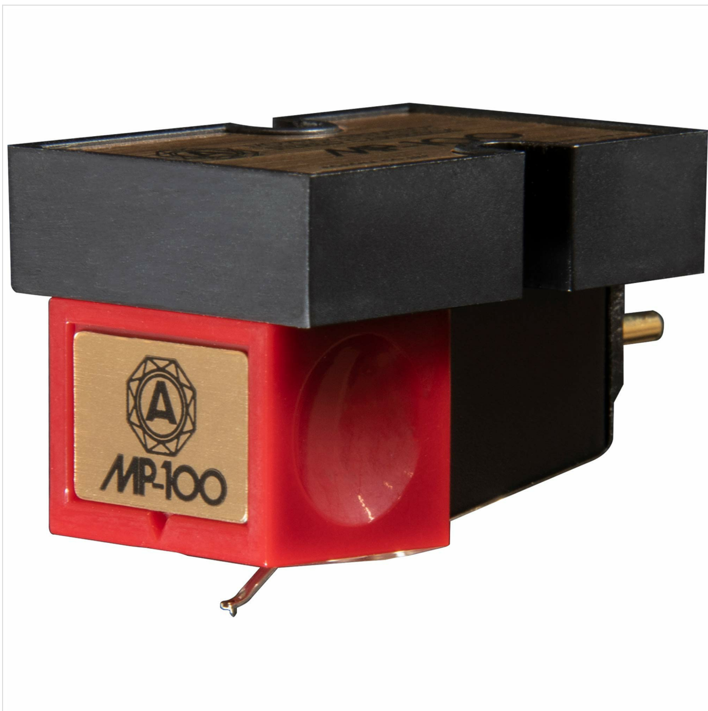
Image: The Nagaoka MP-100 Record Cartridge, featuring its red housing and stylus.