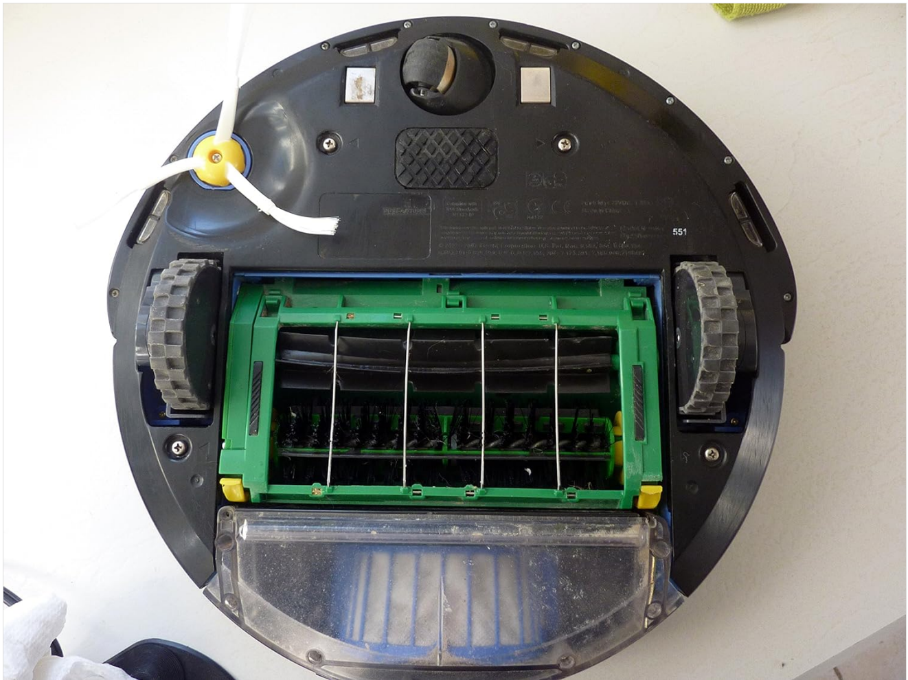
Image: The underside of the iRobot Roomba, displaying the main brushes and the removable AeroVac dustbin compartment.

Empty the dust bin after each cleaning cycle or when the "Bin Full" indicator illuminates. Press the bin release button and slide out the AeroVac Bin. Open the bin door and discard debris. Tap the bin to dislodge any trapped dirt.