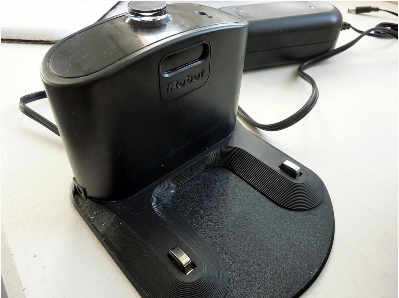
Image: The iRobot Roomba Home Base charging station. The robot docks here to recharge its battery automatically.