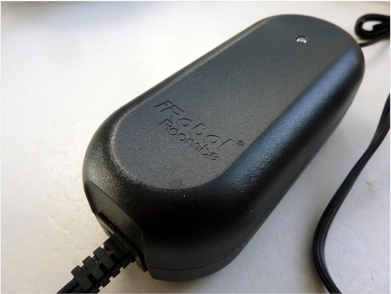
Image: The power charger for the iRobot Roomba, used to supply power to the Home Base or directly to the robot.