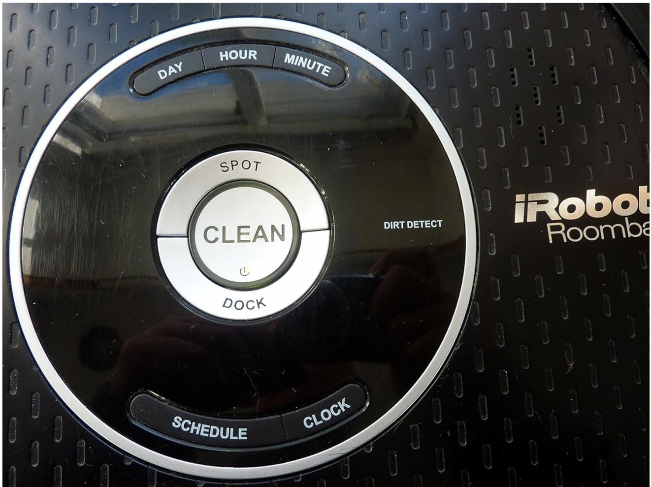
Image: Top view of the iRobot Roomba 550/551, highlighting the control panel with buttons for CLEAN, SPOT, DOCK, SCHEDULE, CLOCK, DAY, HOUR, and MINUTE.

The main control panel on top of your Roomba features several buttons for operation: