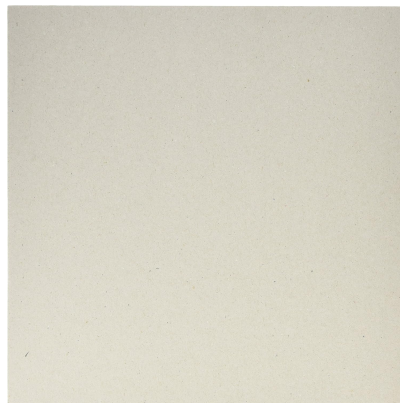
Image: A single sheet of beige chipboard, illustrating its uniform texture and color.

American Crafts Bazzill Chipboard Sheets are high-quality, rigid paperboard sheets suitable for a wide range of creative and practical uses. Each pack contains 25 sheets, each measuring 12 by 12 inches, in a natural beige color.