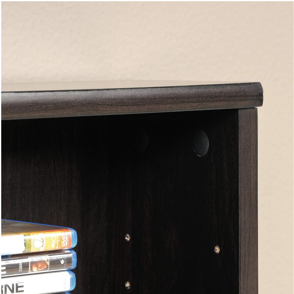
Image: A close-up of the top section of the storage tower, highlighting the cam lock covers and the smooth, curved edge of the top panel. This shows the finished appearance of the unit.