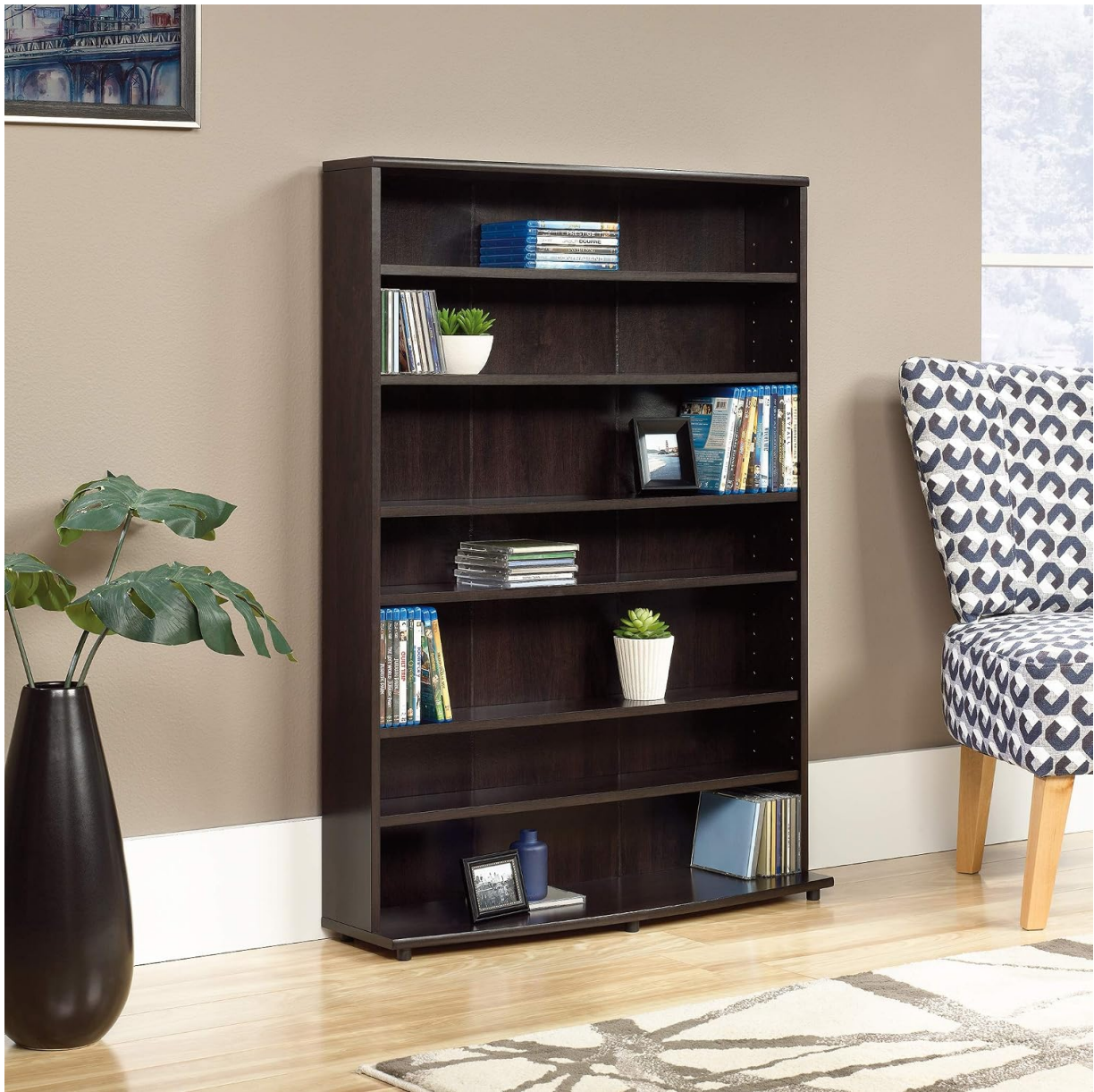
Image: The storage tower filled with a variety of media, demonstrating its capacity for DVDs and CDs. The image shows how different media types can be arranged on the adjustable shelves.