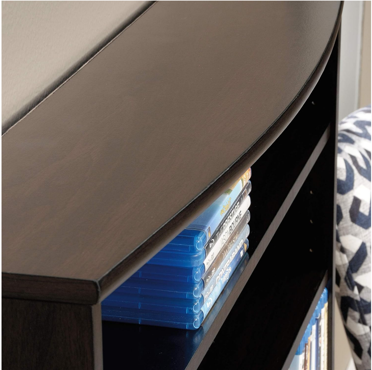
Image: A detailed view of the adjustable shelves within the storage tower, illustrating how media items like CDs and DVDs can be organized. The shelf pins are visible, allowing for customization of shelf height.

Insert the shelf pins into the desired holes on the side panels. Place the adjustable shelves onto these pins. The unit features multiple pre-drilled holes for flexible shelf placement.