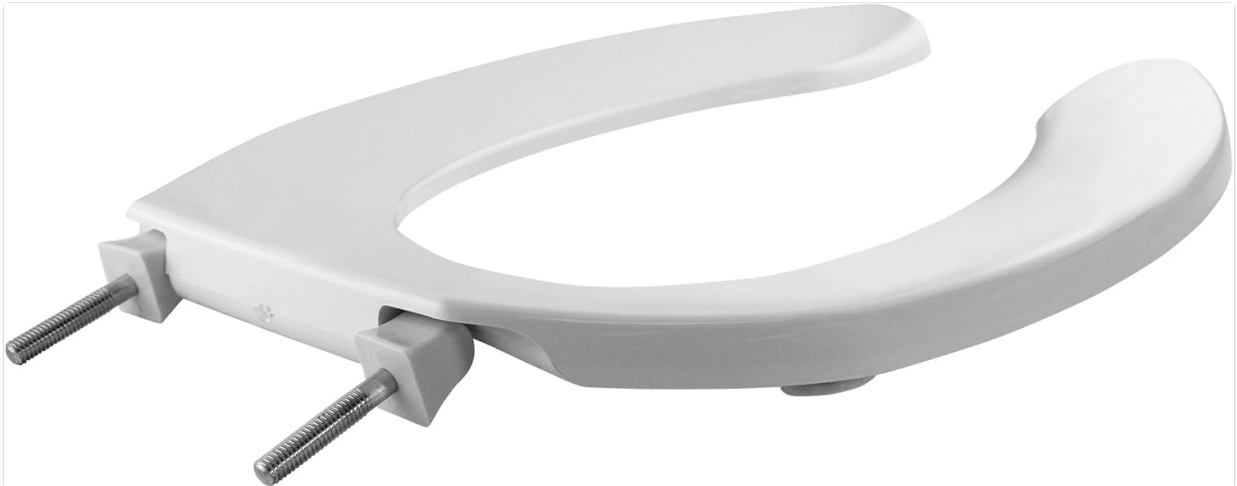
Side view of the BEMIS 1055 toilet seat, showing the durable plastic construction and stainless steel mounting hardware.