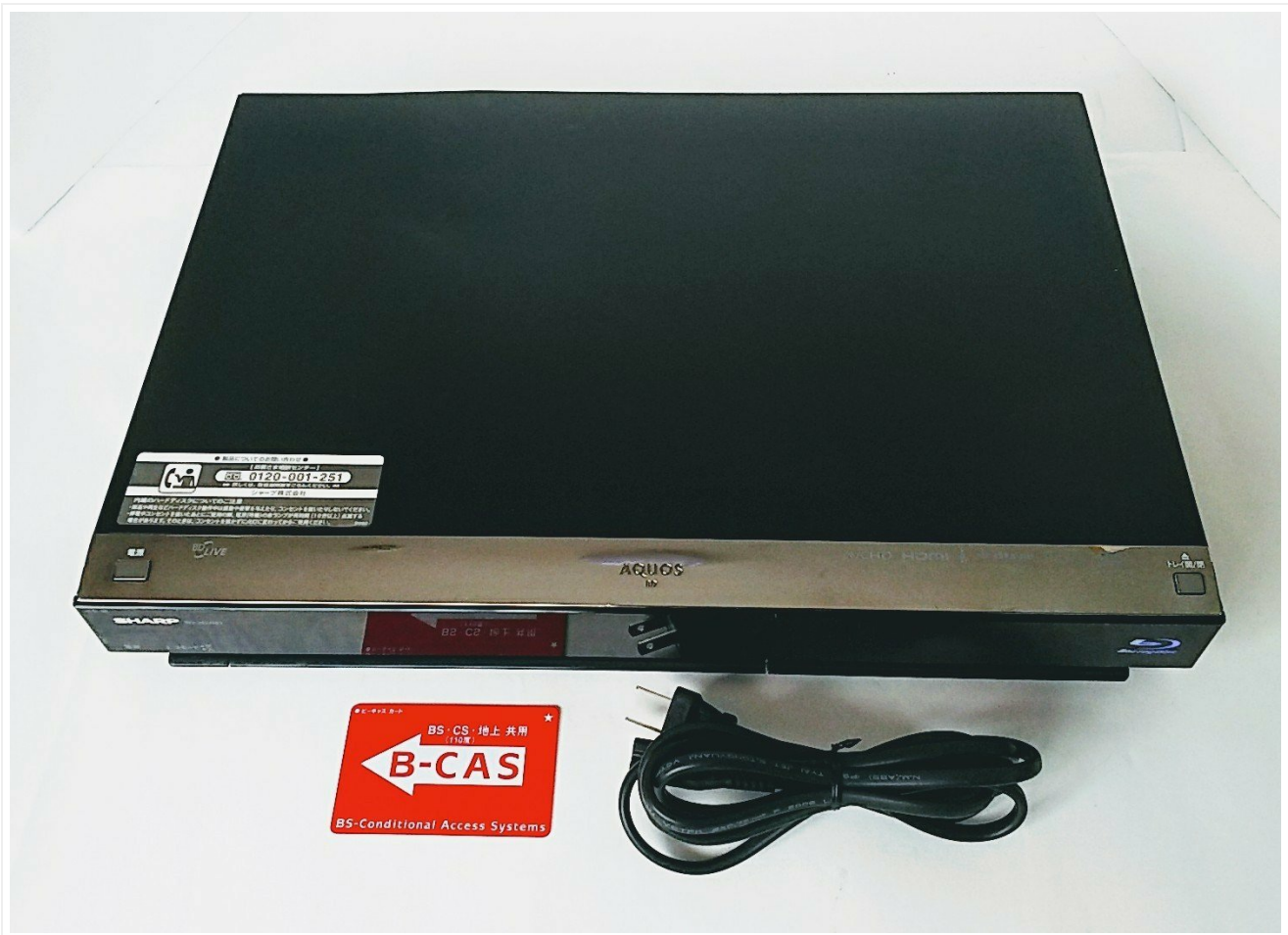
Figure 1: Front view of the Sharp AQUOS BD-HDW43 Blu-ray Recorder.