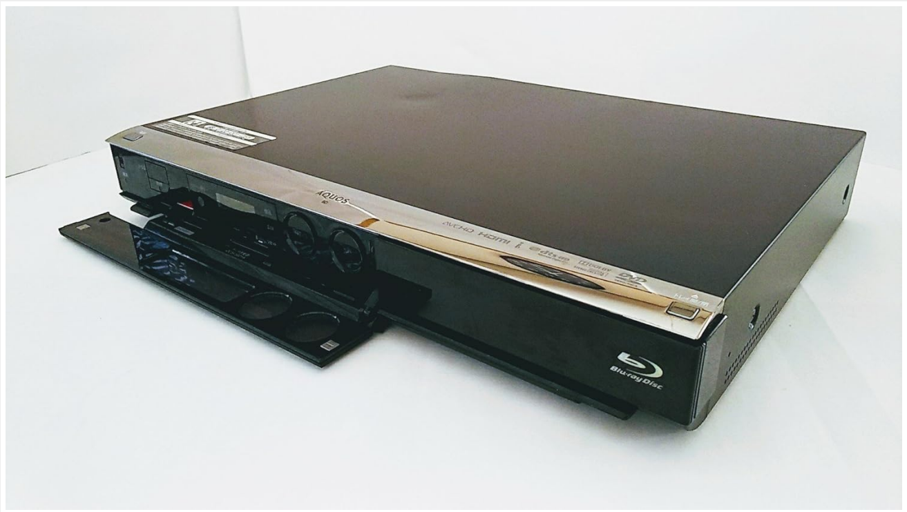
Figure 3: Front panel of the recorder with the disc tray open, showing controls.