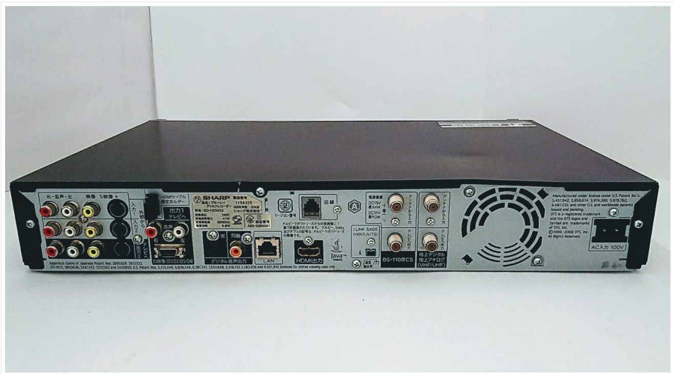
Figure 2: Rear panel connections of the Sharp AQUOS BD-HDW43 Blu-ray Recorder.